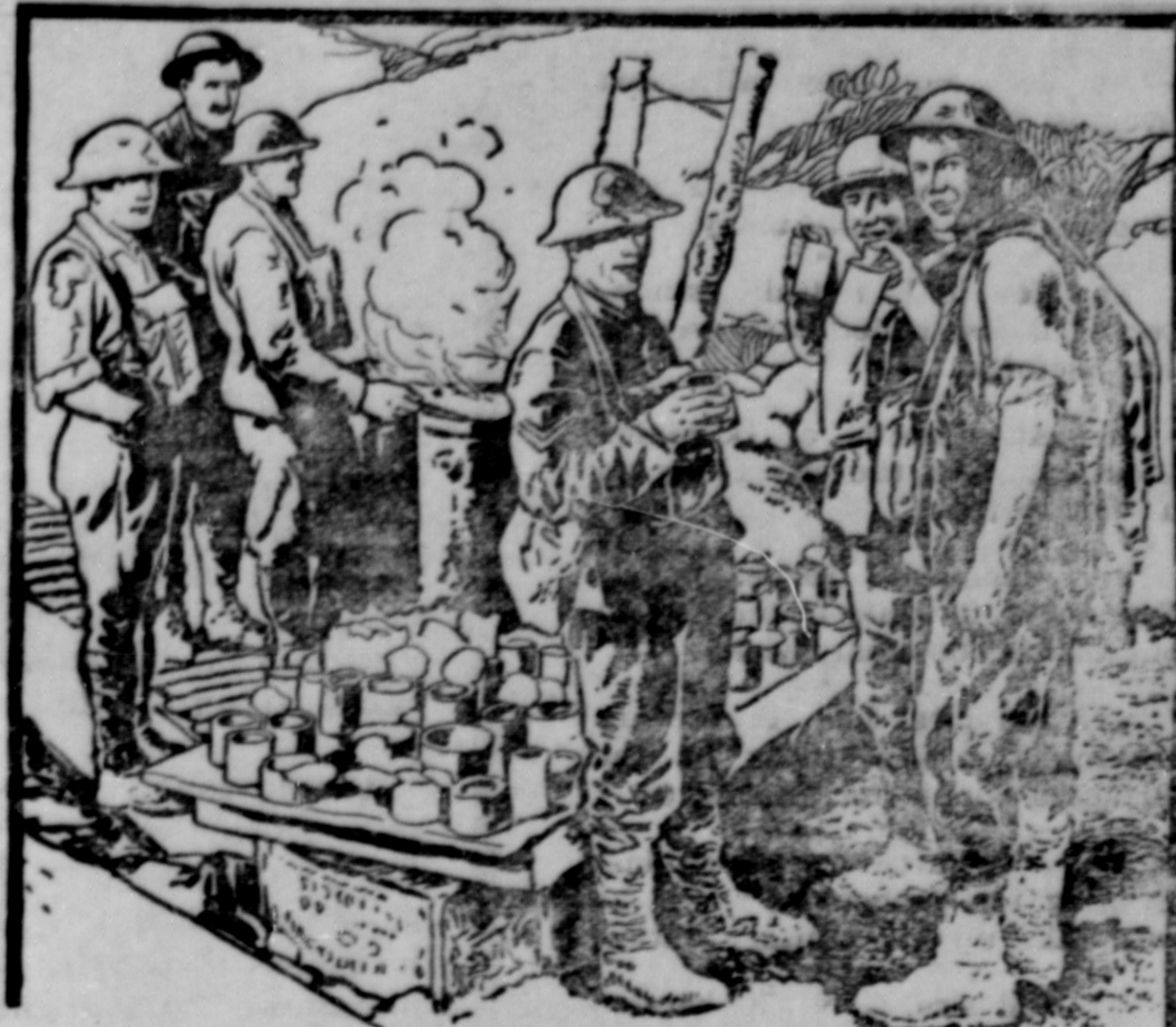
Y. M. C. A. man serving coffee 100 yards from German Trenches

Serve your Country by your labor and make a gift to the Red Triangle Fund from your earnings! What a fine chance to do a double service! Six thousand boys are asked to give $10 each. Of the total, $50,000 goes to help the soldiers, the balance for boys' work. Gifts must be at least $10, the standard unit. A boy may subscribe more than $10 in $10 units but not less. A beautifully engraved certificate will be given to each subscriber. Ask your local Y. M. C. A. representative for pledge card and full information.