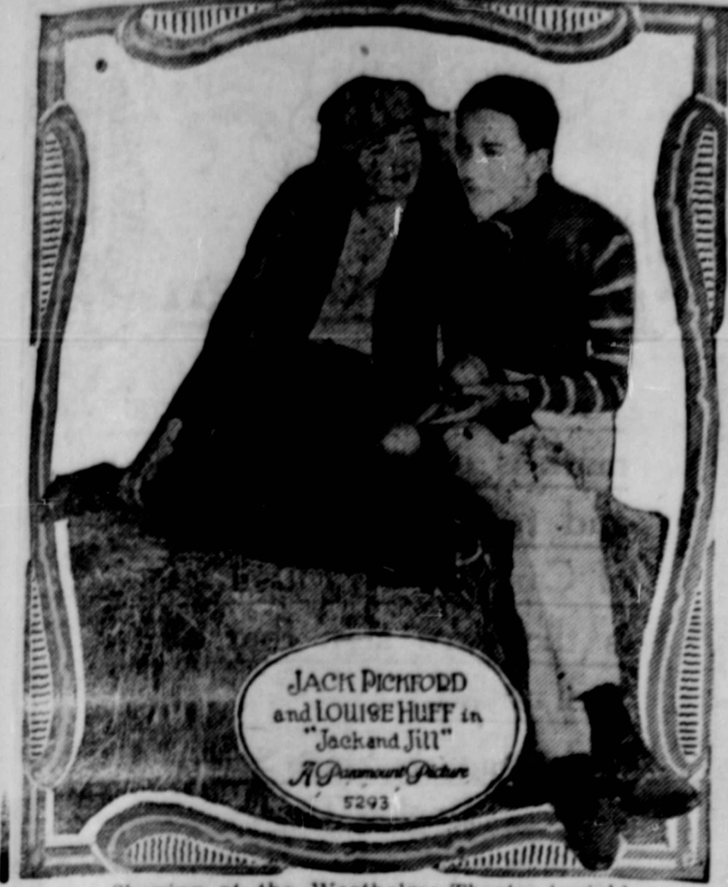
JACK PICKFORD and LOUISE HUFF in "Jack and Jill" A Paramount Picture 5293

Showing at the Westholme Theatre tonight.