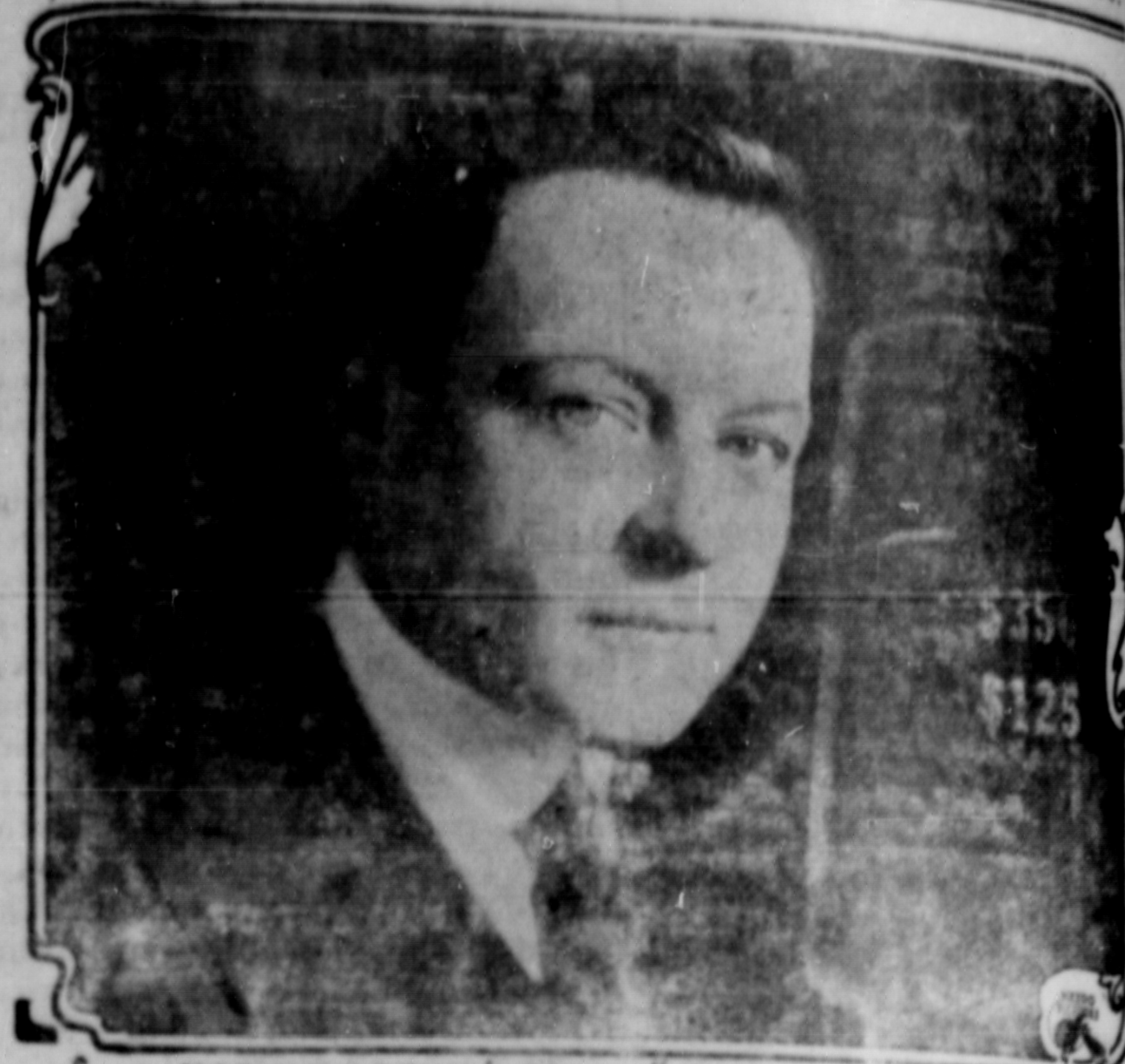
HAROLD LOCKWOOD, IN "PIDGIN ISLANDS" Showing at the Westholme tonight