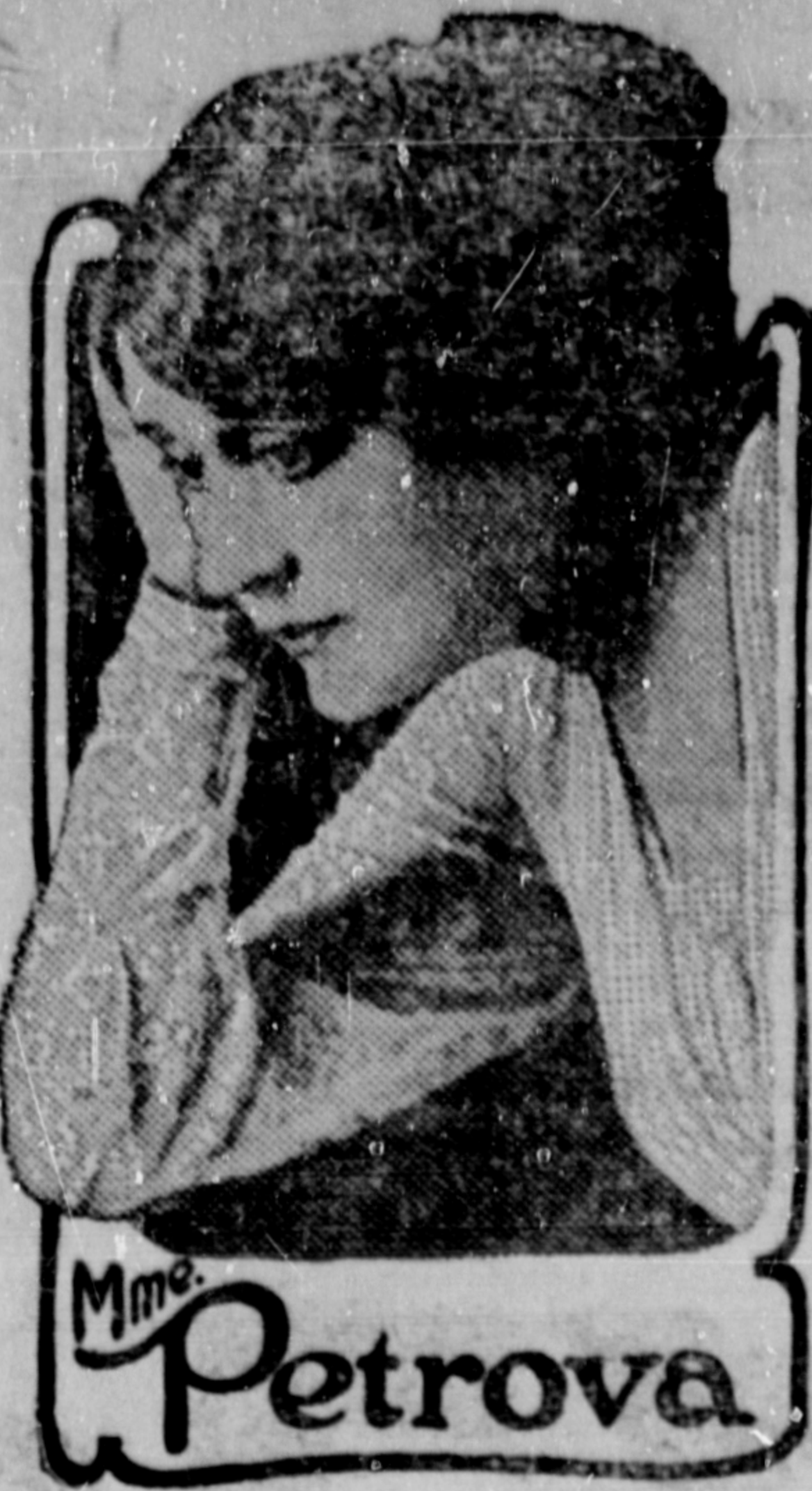
At the Westholme Tonight.

Take a trip to the salt lakes on the launch Alice B. Boat leaves P. R. Boat House for salt lakes every hour commencing 10 a. m. on Sundays and 2 p. m. on Wednesdays. On other week days two trips starting at 6 and 7 p. m. Round trip Sundays, 35c, week days, 50c. Launches, rowboats, and canoes for hire at all times. Gov't. Wharf, phone Red 391. P. R. Boat House. 11