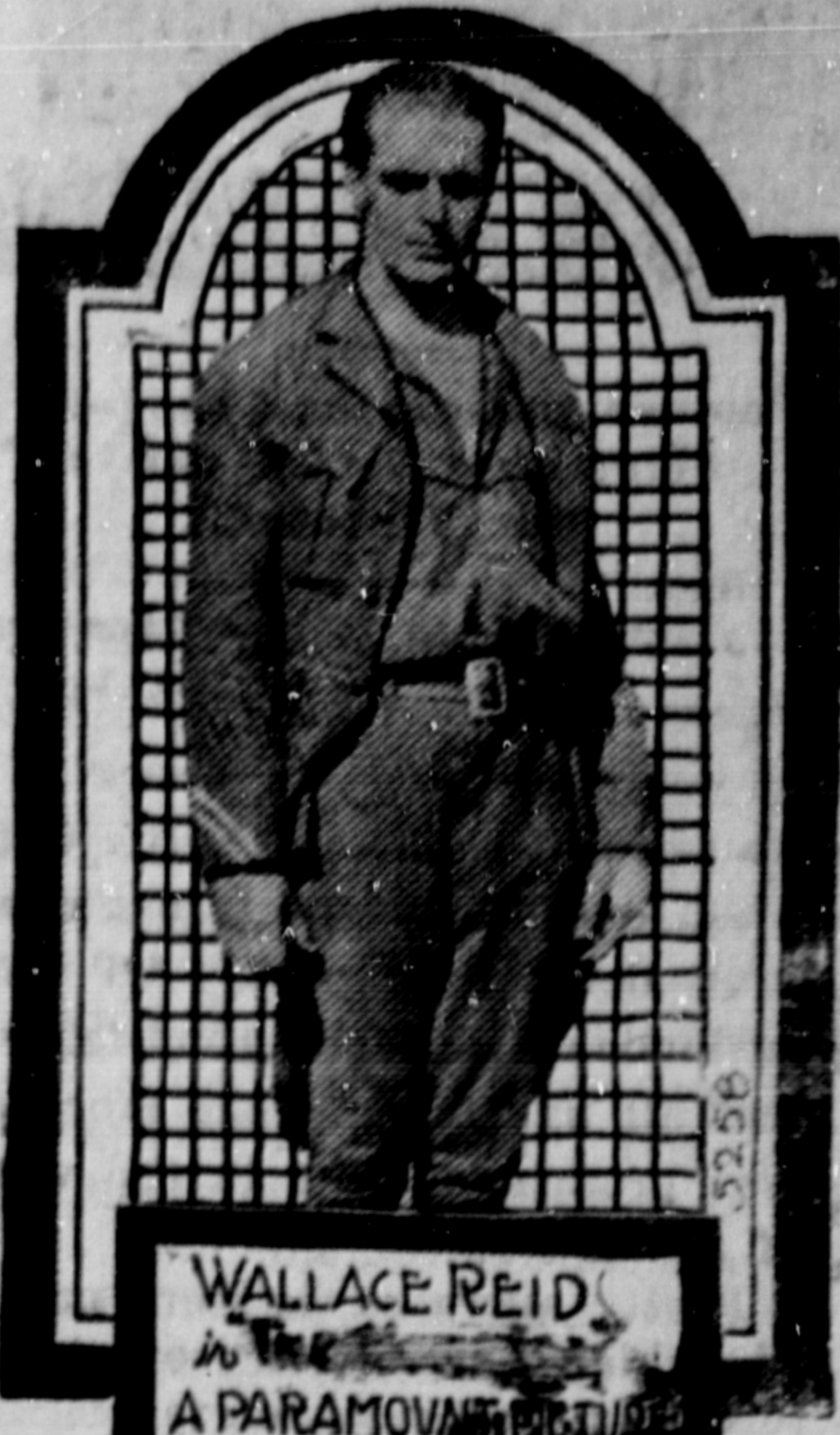
At the Westholme Tonight.