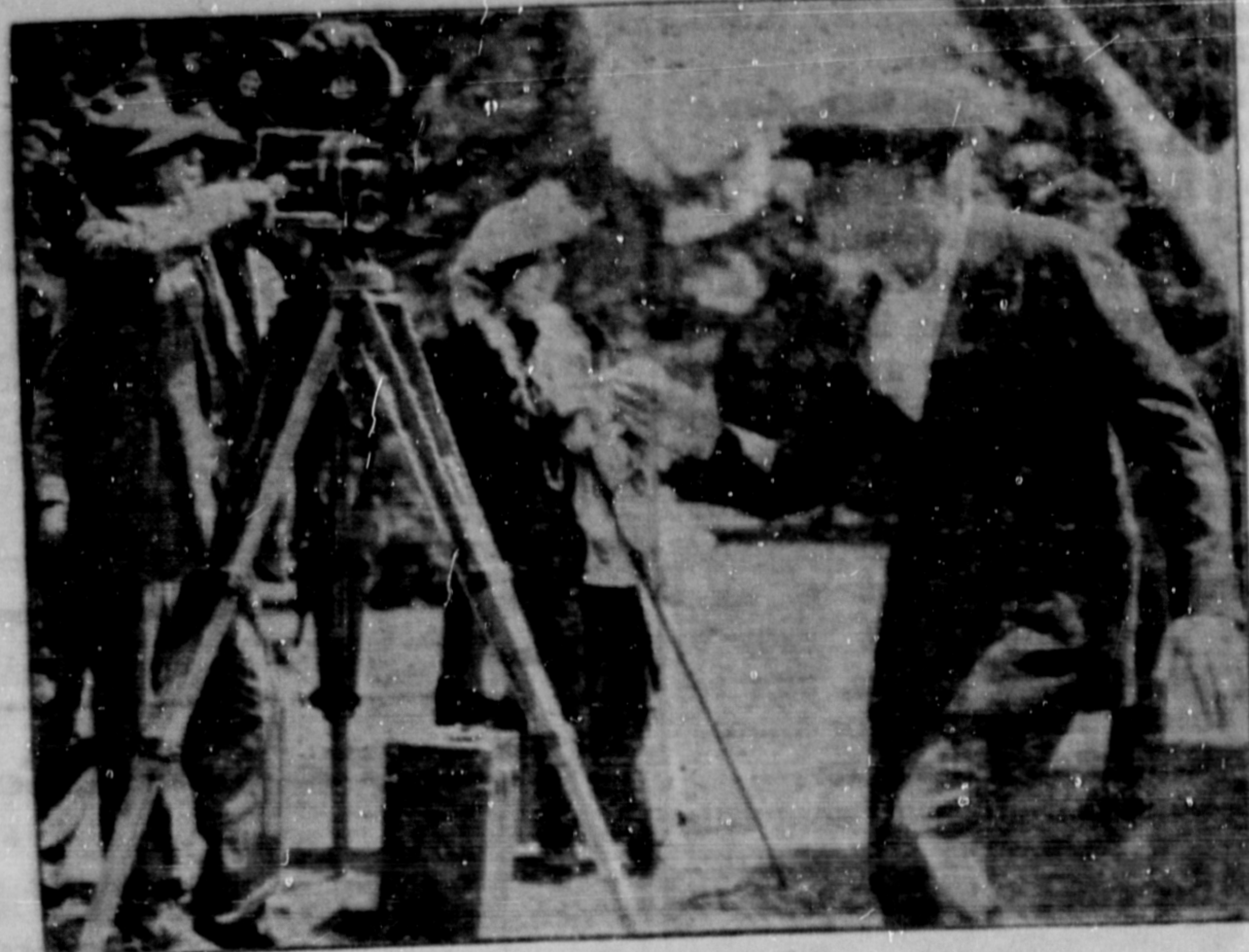
HAROLD LOCKWOOD, the famous Metro Star who died a day or two ago from influenza. In the picture he is making his exit from a scene which is being photographed.