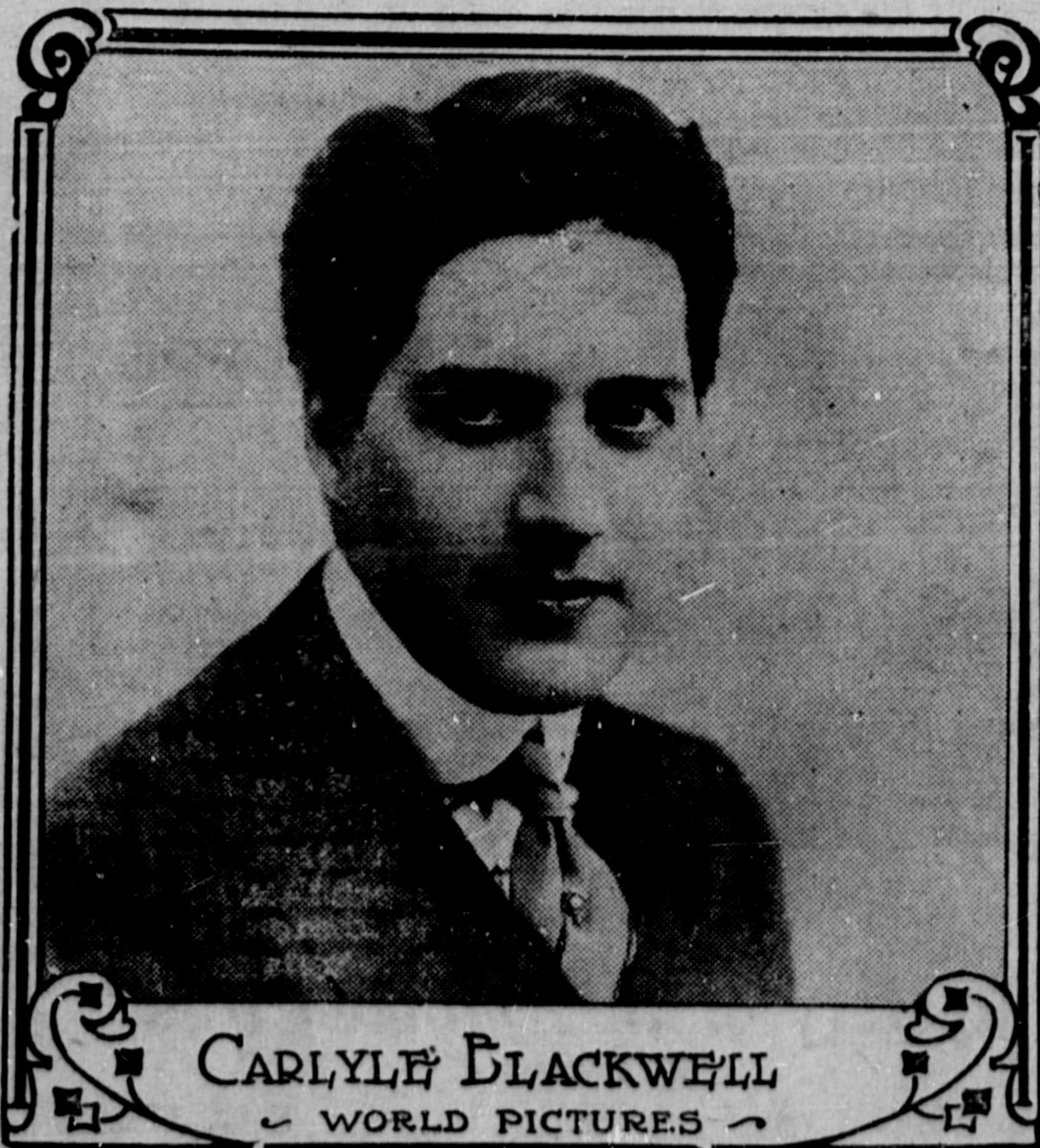
CARLYLE BLACKWELL — WORLD PICTURES —

The Leading Daily of Northern British Columbia