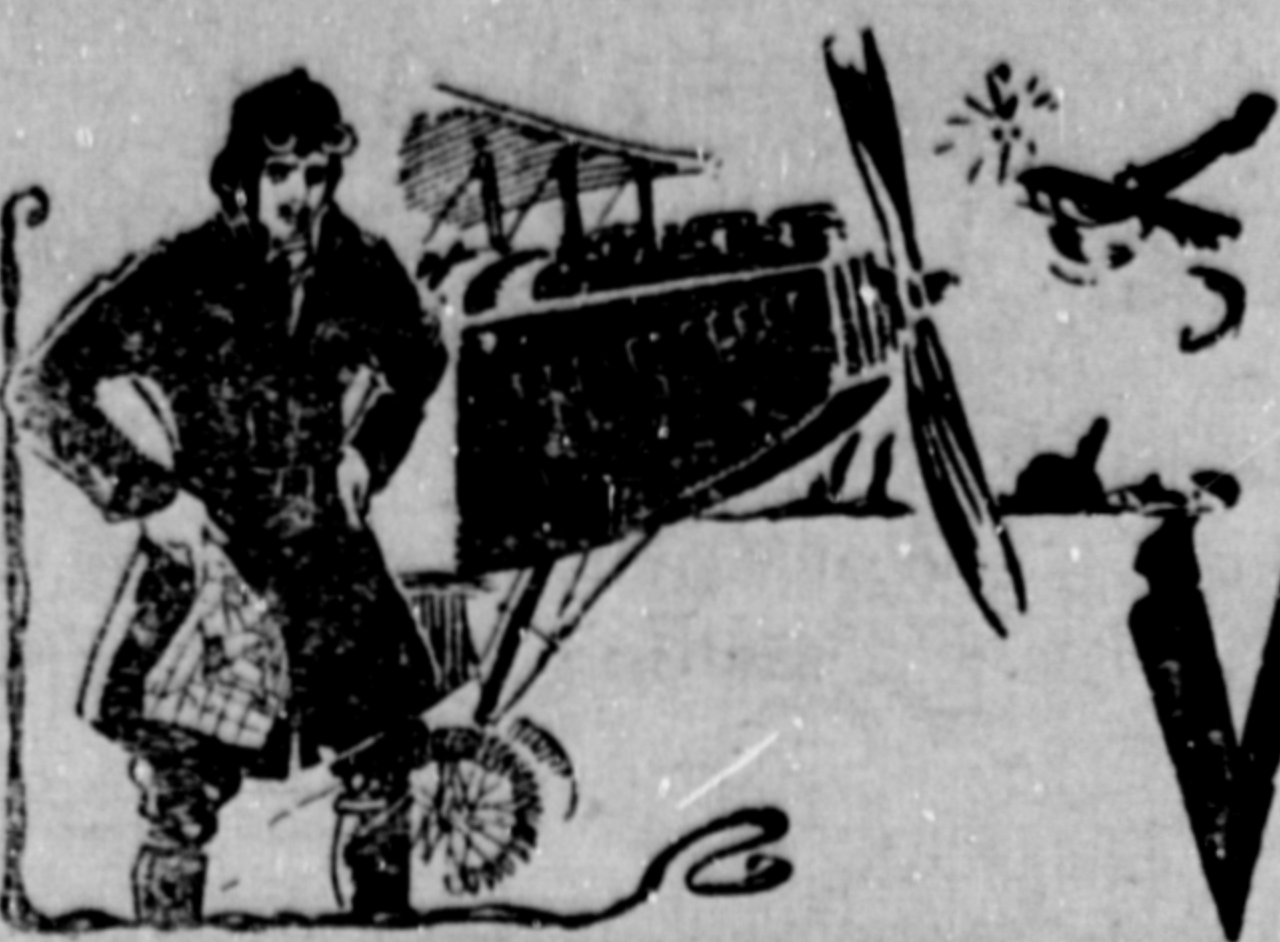
Article No. 10 Cut out for Reference