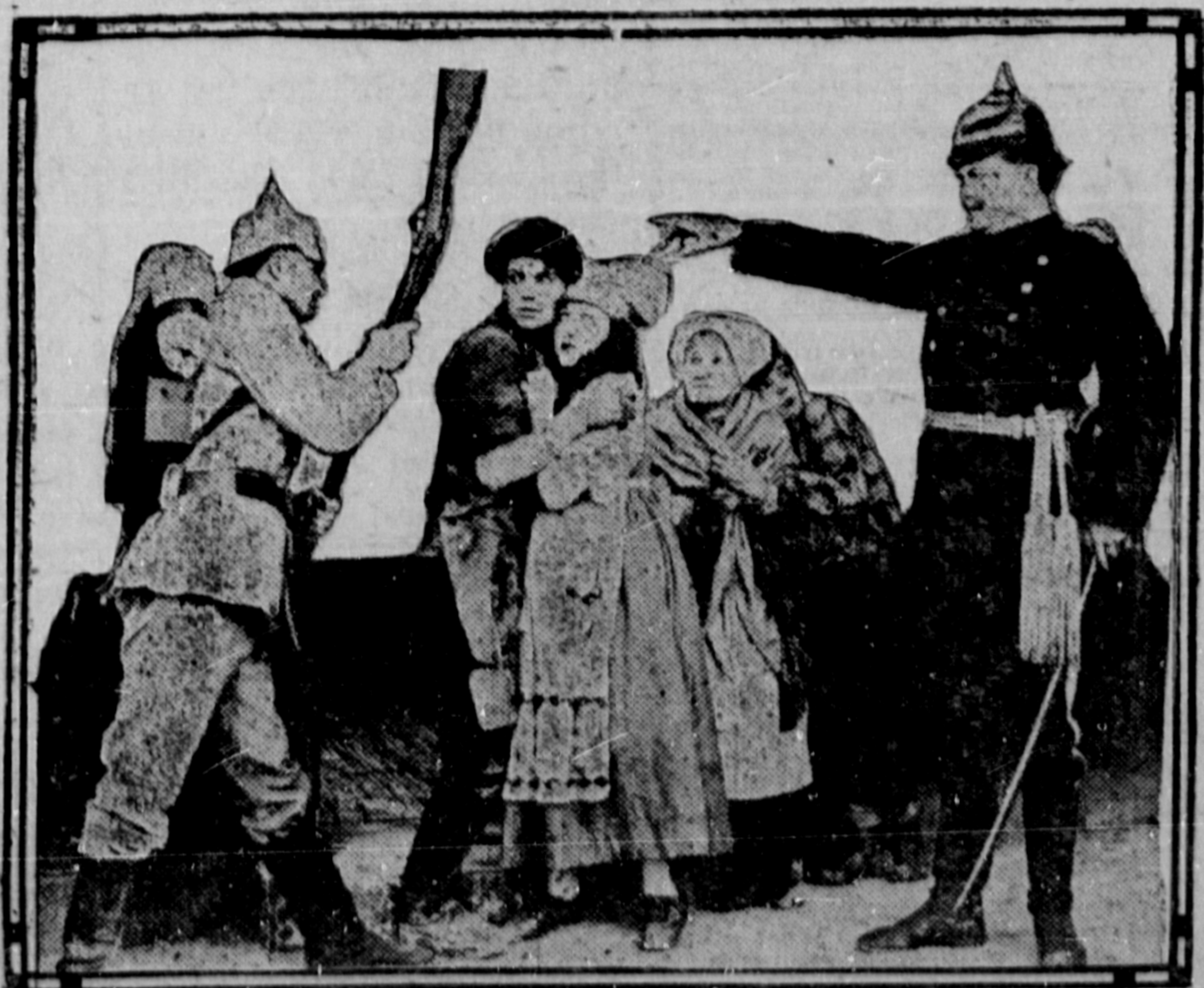
"KILL THE BELGIAN SWINE" (SCENE FROM THE KAISER, THE BEAST OF BERLIN)

Fifty cent meals from 11.30 to 2.00 and 5.30 to 8.00. Short orders all the time. Special rates with room and board.