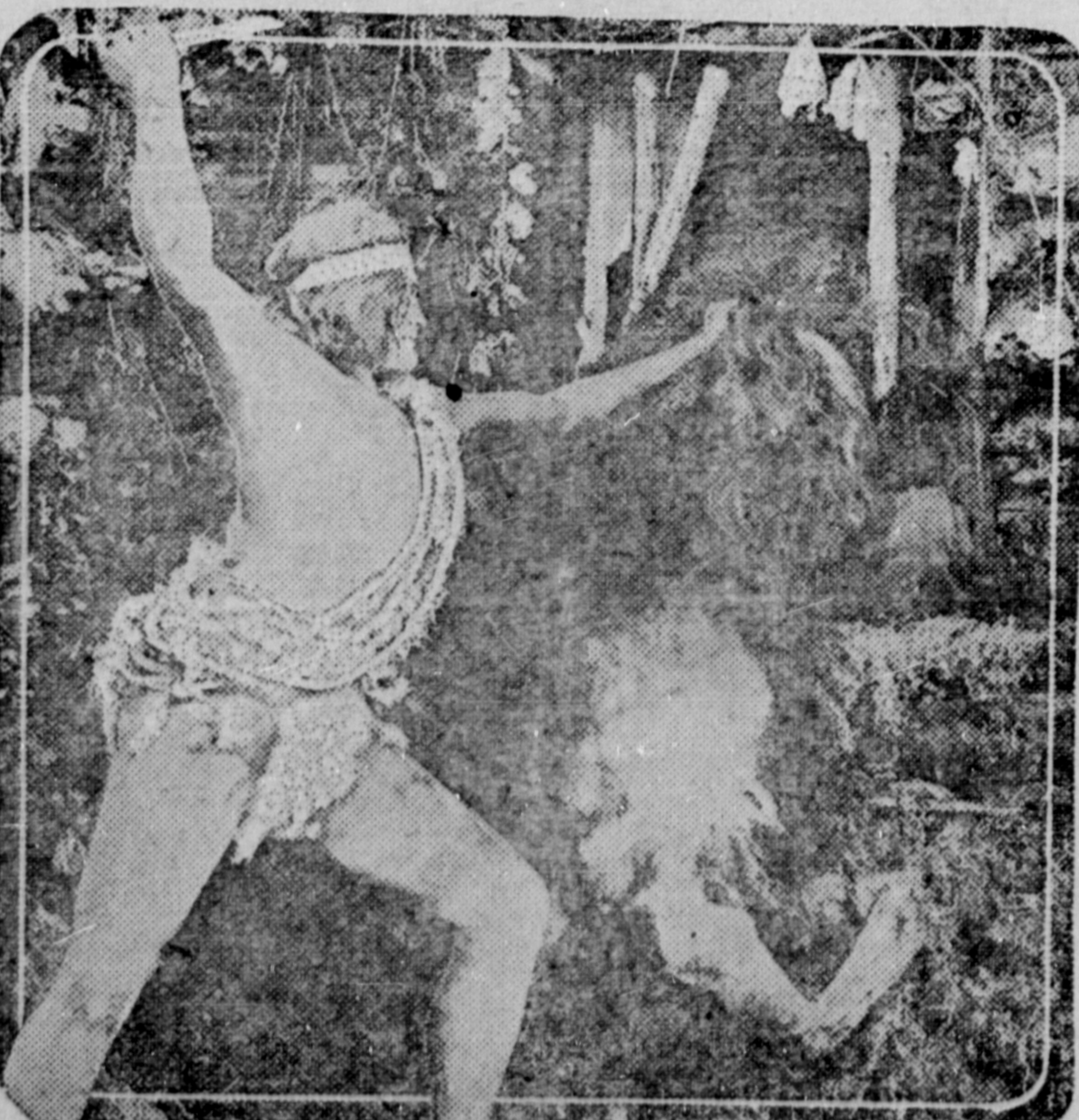
TARZAN OF THE APES DROVE HIS KNIFE DEEP INTO THE LION

Starring tonight at the Westholme Theatre.