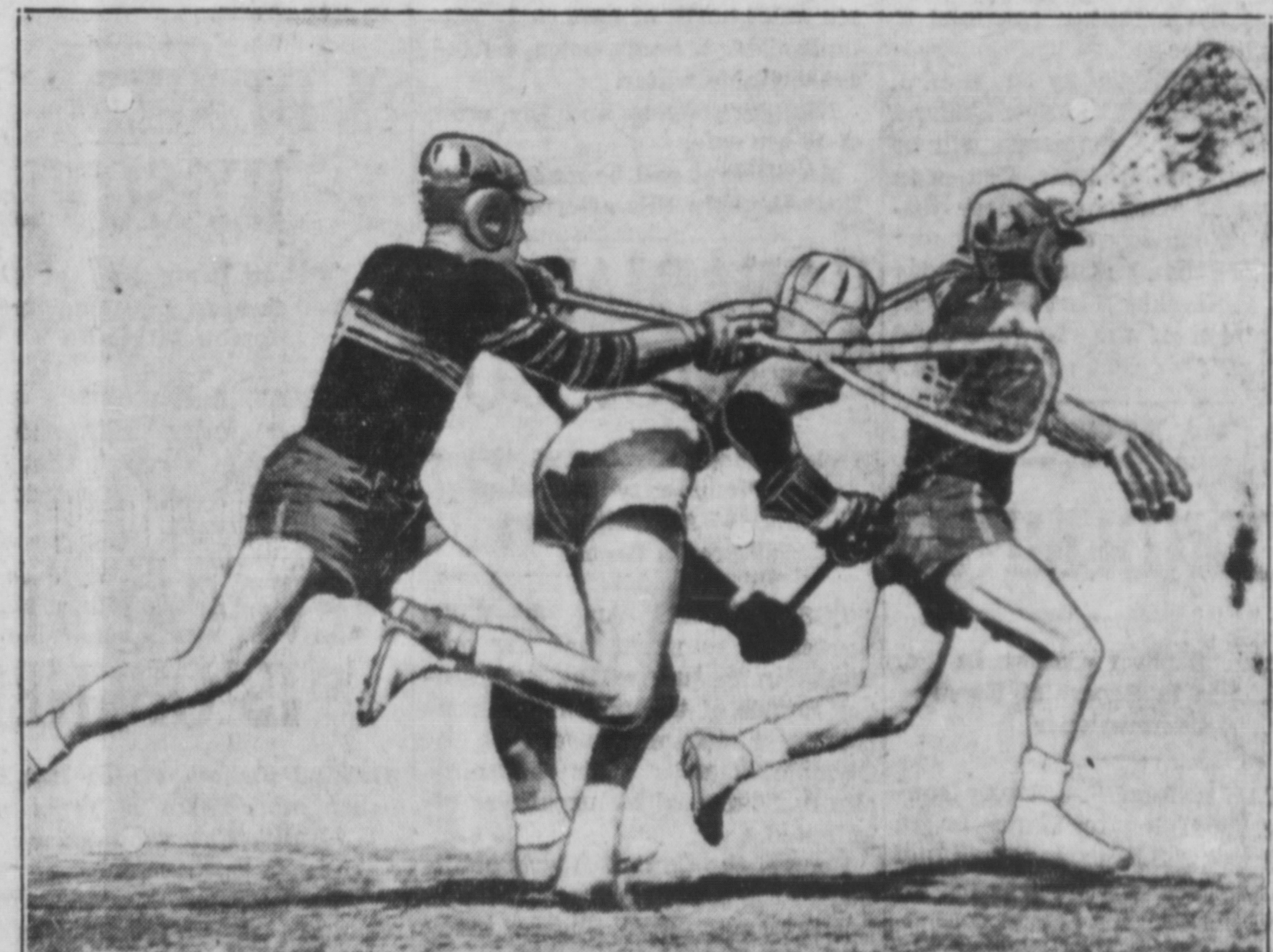
An exciting moment during tense battle at Baltimore between the Marylands and Johns Hopkins which the latter won, 7 to 5, thereby earning the right to play at the olympic games. The victors had to come from behind to win.