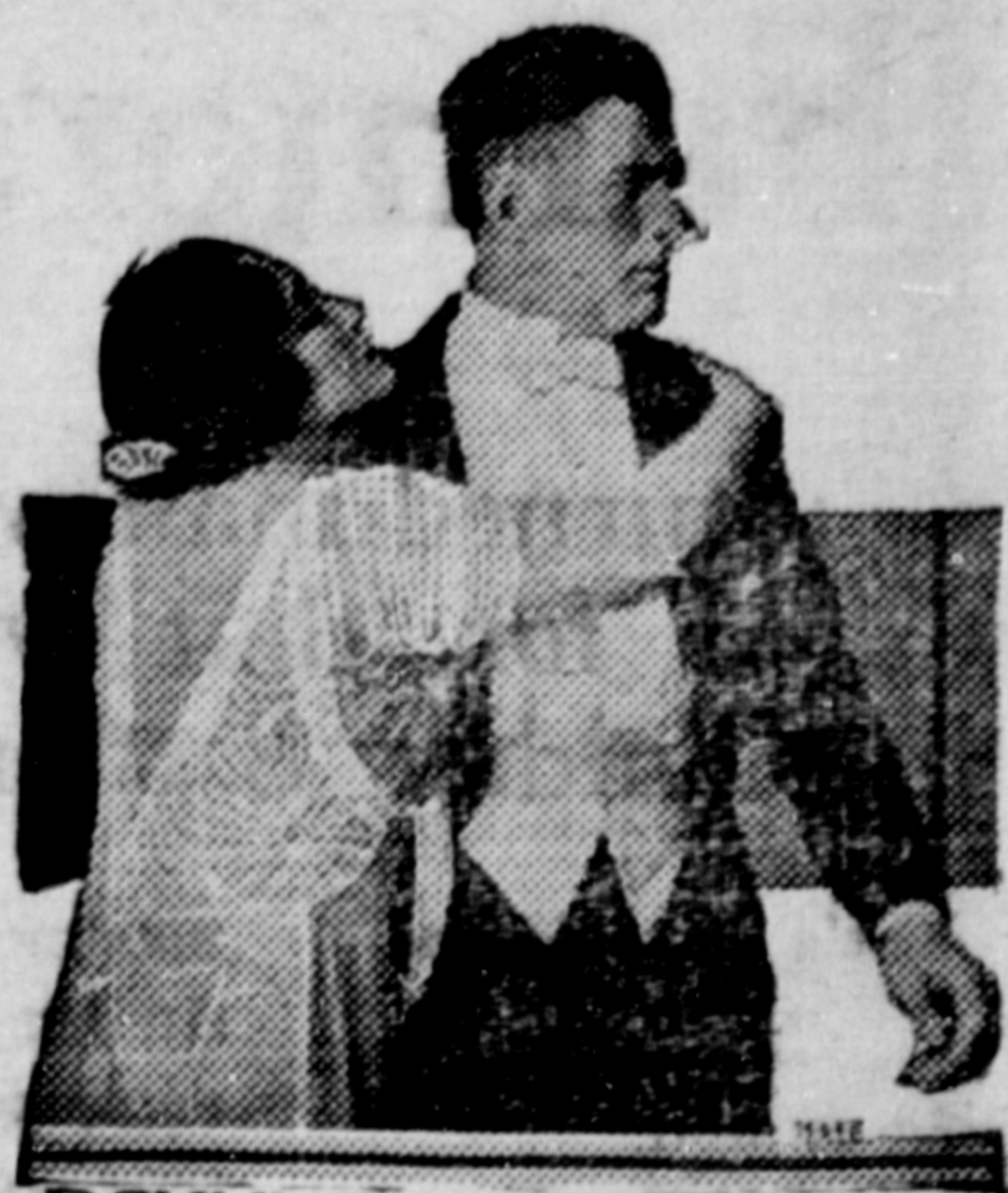
PAULINE FREDERICK in "Fedora" A Paramount Picture

The famous death scene in "Fedora," when, to save her husband from the disgrace of murdering the woman he loves, Fedora, his wife, takes poison and dies a suicide, is perhaps one of the most dramatic scenes of the new Paramount photoplay starring Pauline Frederick, which