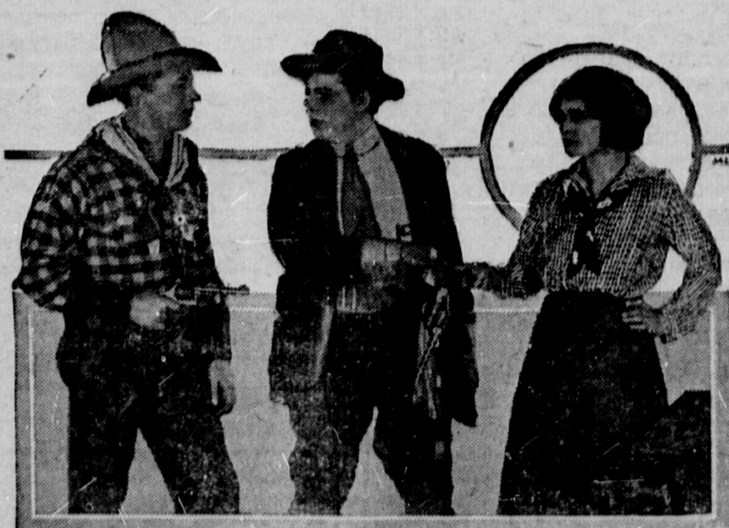
ELSIE FERGUSON in Heart of the Wilds

A number of people have advertised furniture for sale in this paper and they have had dozens of customers as a result. Some people want to keep their furniture. They do not advertise.