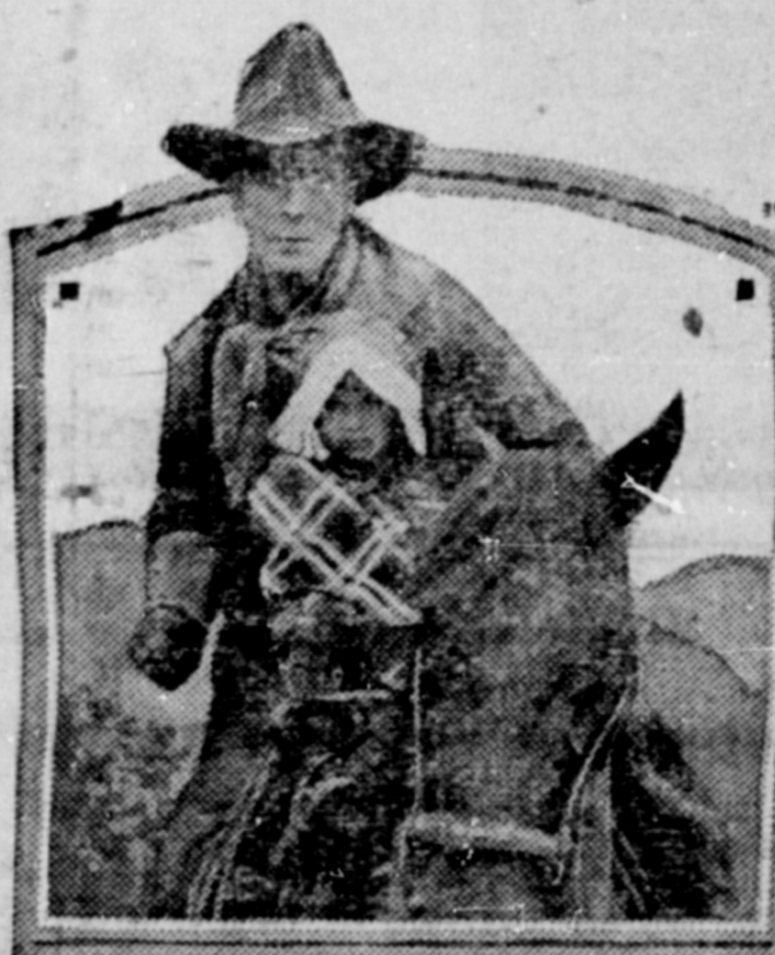
WILLIAM S. HART "The Riddle Gawne" An Ancient Drama

Never forget to look through the classified list on Page 5.