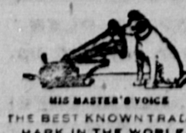
THE BEST KNOWN TRADE MARK IN THE WORLD