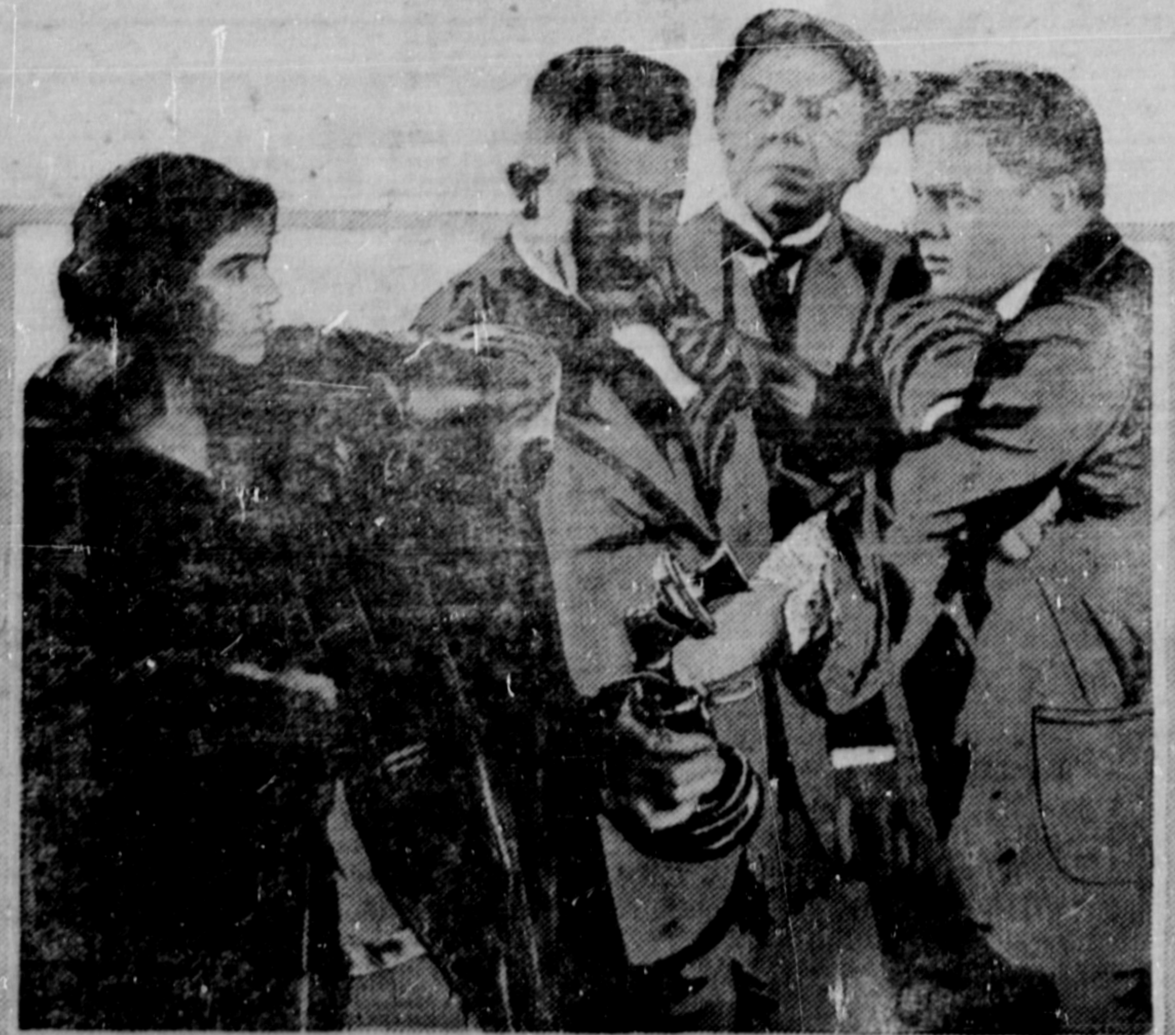
Pro-German and patriot in conflict. Starring tonight at the Westholme Theatre.

To our patrons, any suggestions that tend to the improvement of our service will be appreciated by the management.