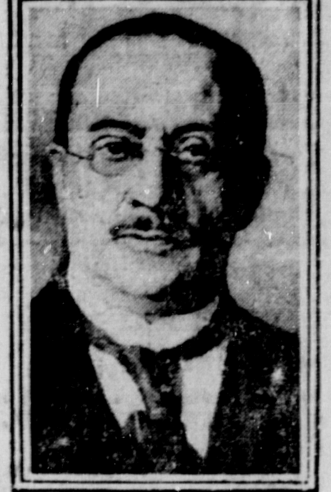
Herr Robert Schmidt is the new Minister of Labor in the Cabinet formed by Dr. Wirth. He is a Socialist and was formerly the Minister of Agriculture.