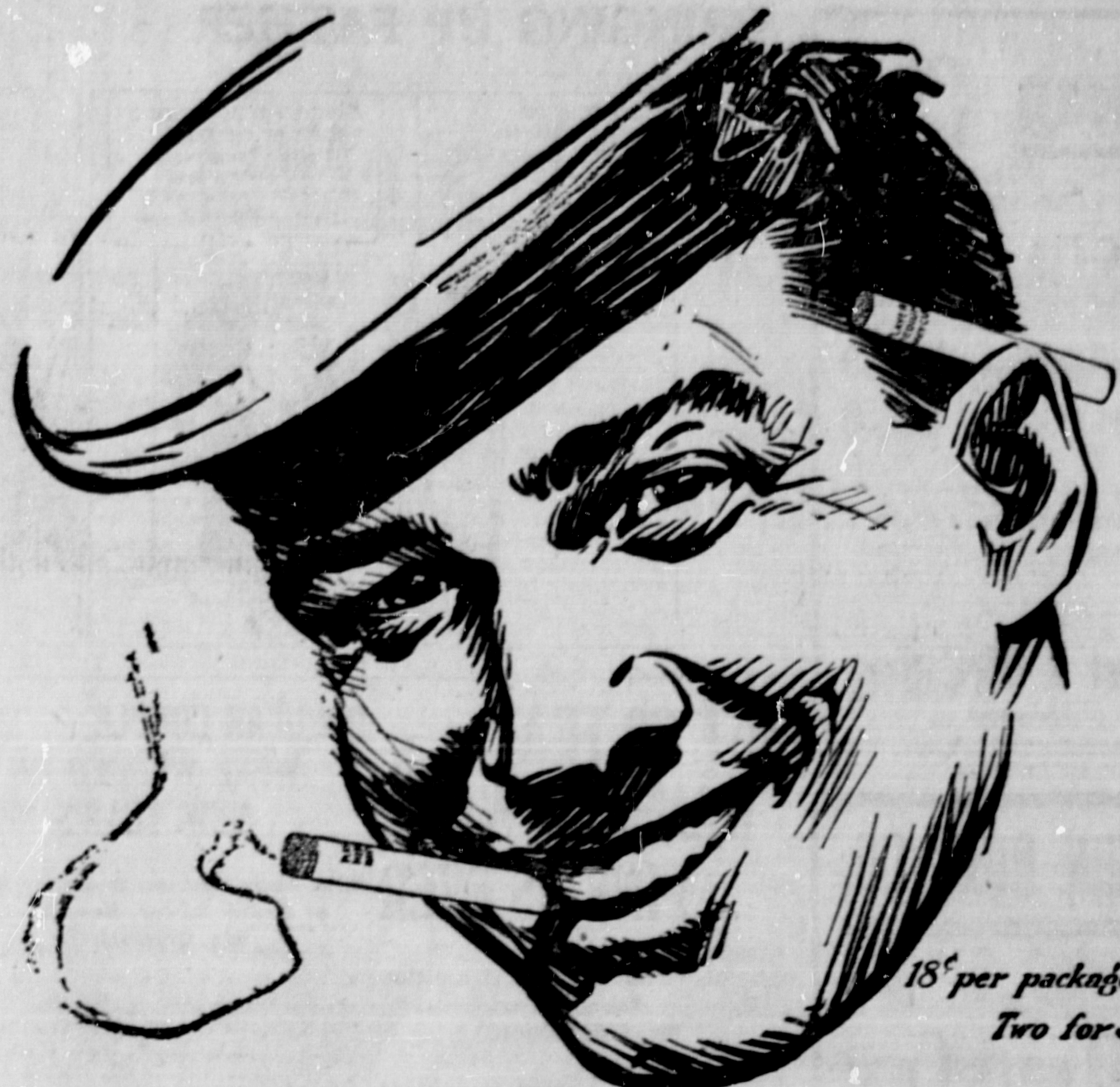
18¢ per package Two for 35¢

PILES Do not suffer another day with itching, bleeding, or protruding Piles. No surgical operation required. Dr. Chase's Ointment will relieve you at once and afford lasting benefit. 50c. a box, all dealers, or Edmanson, Bates & Co., Limited, Toronto. Sample box free if you mention this paper and enclose 2c. stamp to pay postage.