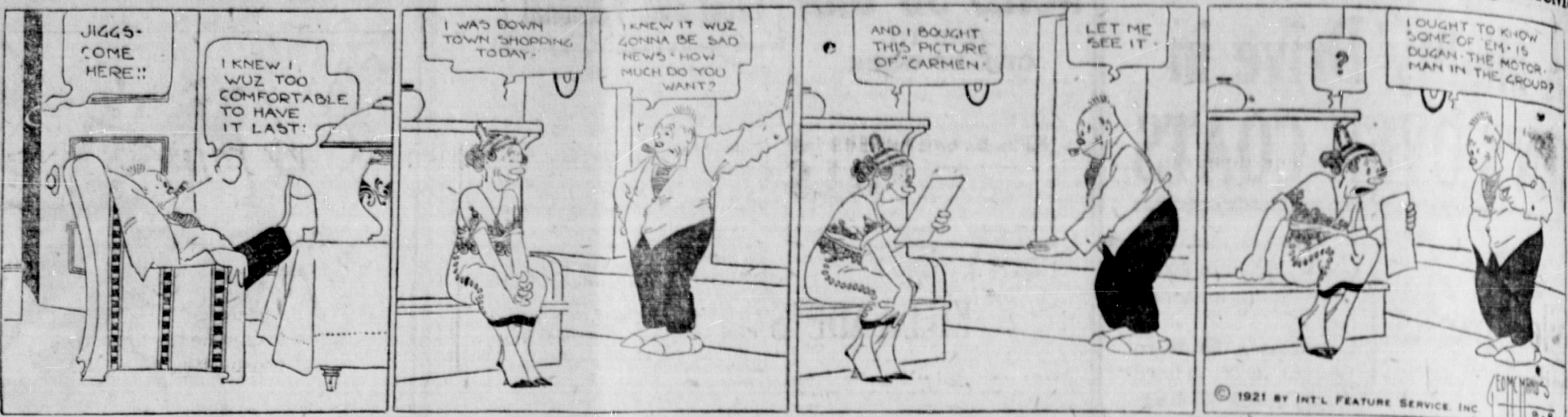
© 1921 BY INTL. FEATURE SERVICE, INC.