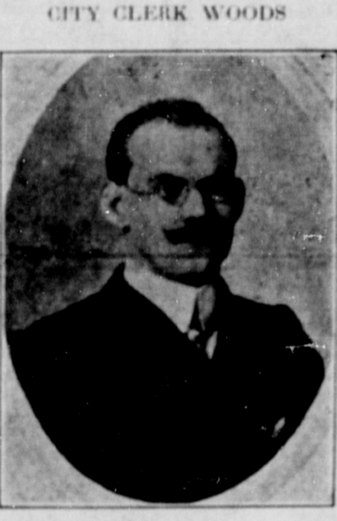
Who has announced election returns for many years.

The Republic sold 35,000 lbs. to the Cold Storage Co. at 16.8c and 6c.