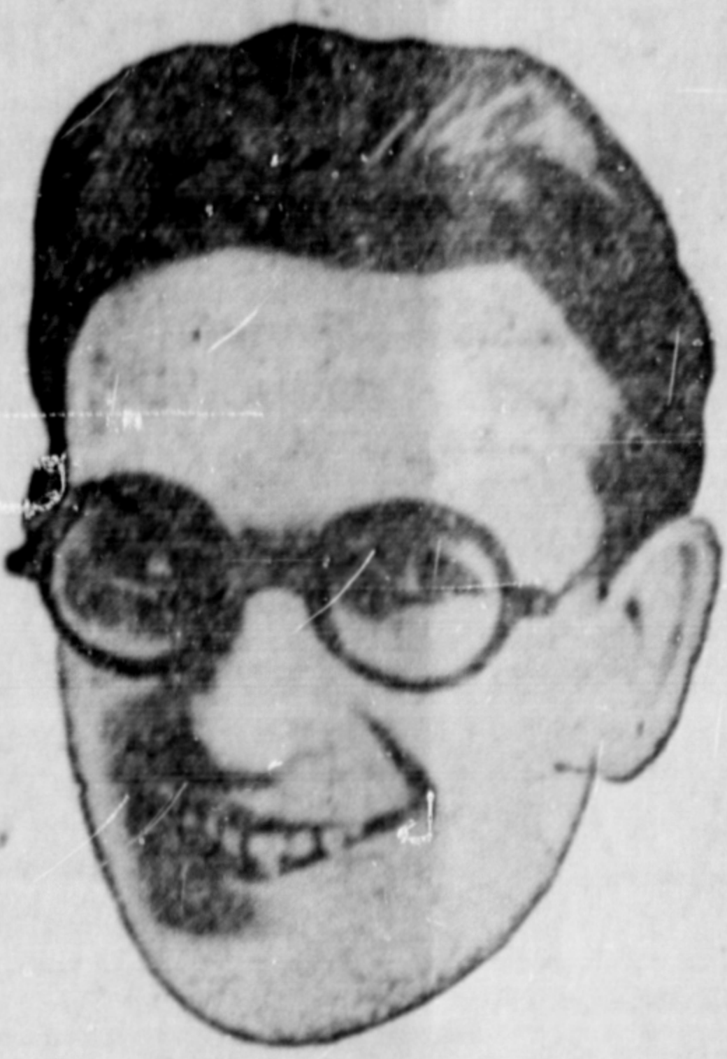
HAROLD LLOYD At the Westholme Tonight

ECZEMA You are not experimenting when you use Dr. Chase's Ointment. It relieves at once and gradually heals the skin. Sample box Dr. Chase's Ointment free if you mention this paper and send 2c. stamp for postage. One box; all dealers or Edmanston, Bates & Co., Limited, Toronto