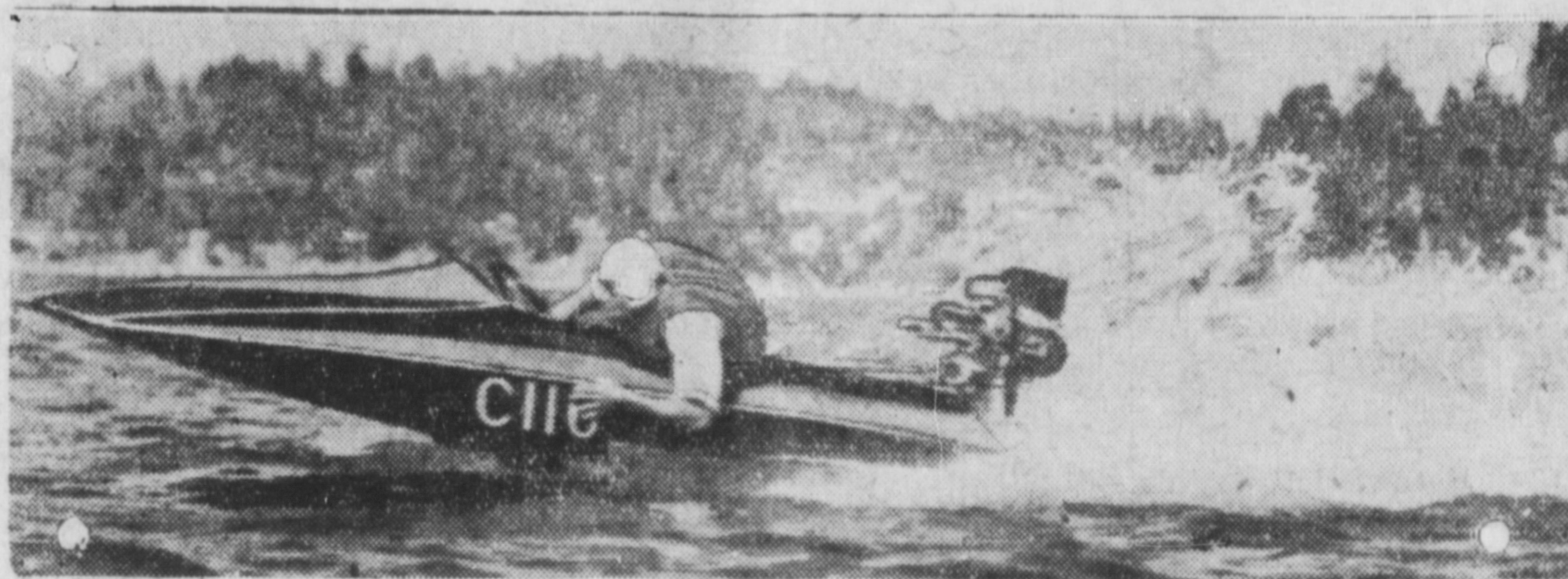
High in the San Bernardino mountains, California. You Wouldn't think it, would you? You thought it was just another sea flea picture we'd found in the files. A movie star or something's driving this crate. Which makes it awfully interesting—don't you think?