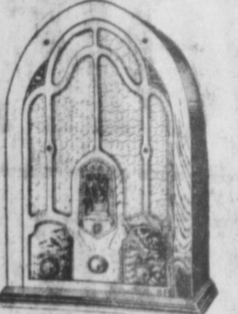
G-E Table Model J-72 (7 Tubes) $69.50 Complete with New Type G-E Radiotrons

Read over the radical new features of this great General Electric Radio. Then by all means hear it.