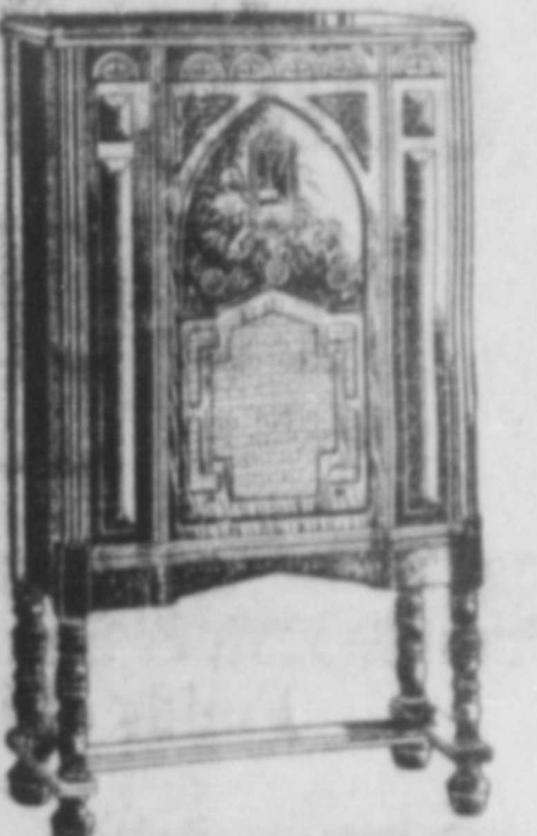
G-E Console Model J-86 (8 Tubes) $109 Complete with New Type G-E Radiotrons