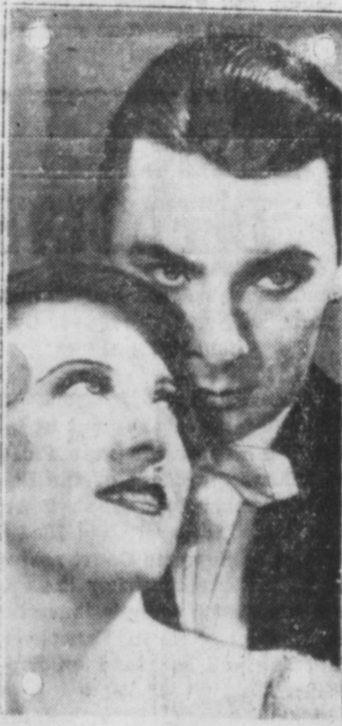
One at a time, Ruth. This said George Brent, male screen hero, will marry Ruth Chatterton—as soon as she gets a Reno from Ralph Forbes

The end of man is an action and not a thought, though it were of the noblest.—Thomas Carlyle.