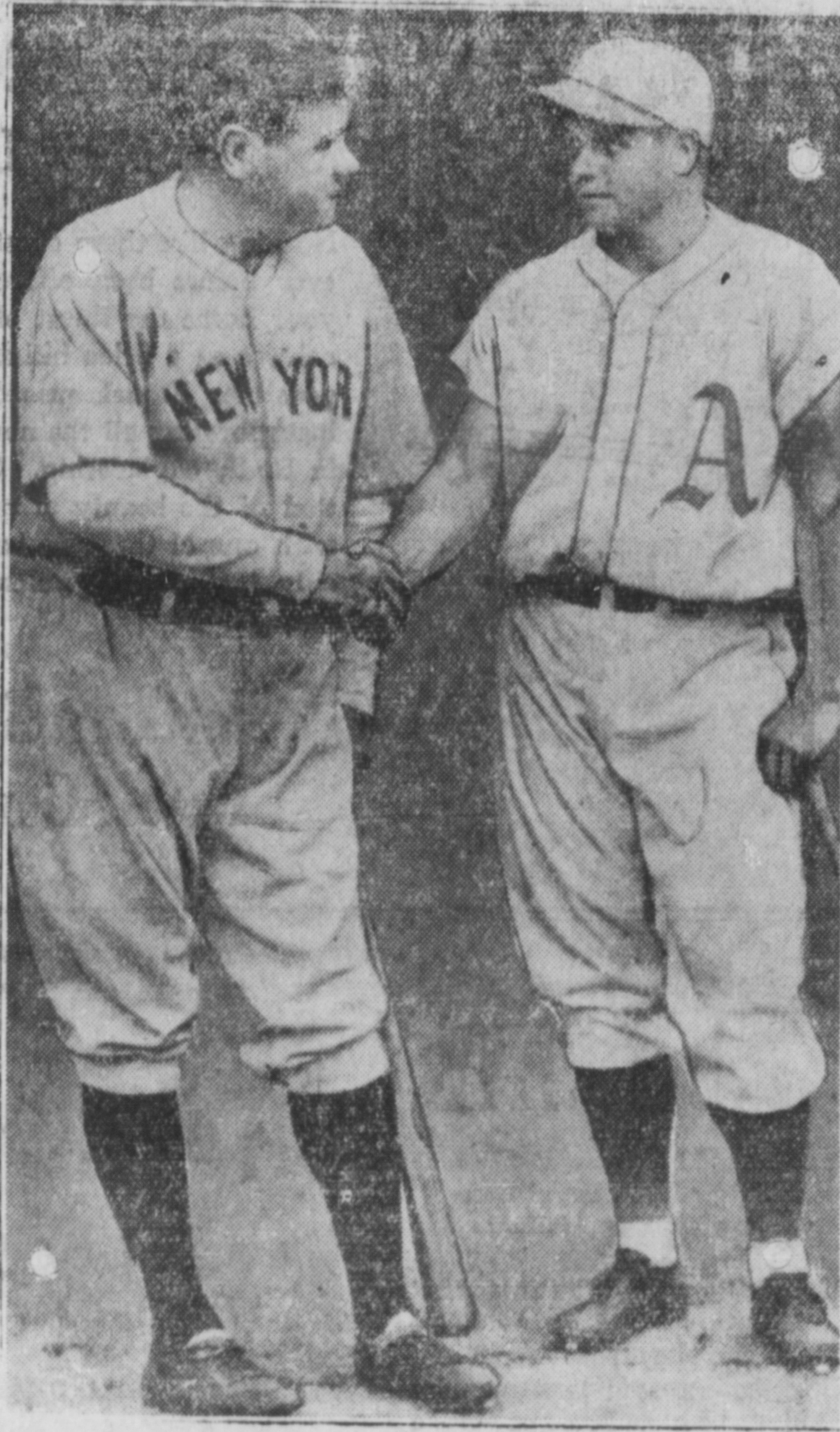
The Big Bambino takes time out to congratulate Jimmy Fox of Athletics who succeeded him as home run king of 1932. Jimmy hit his fifty-fourth that day.