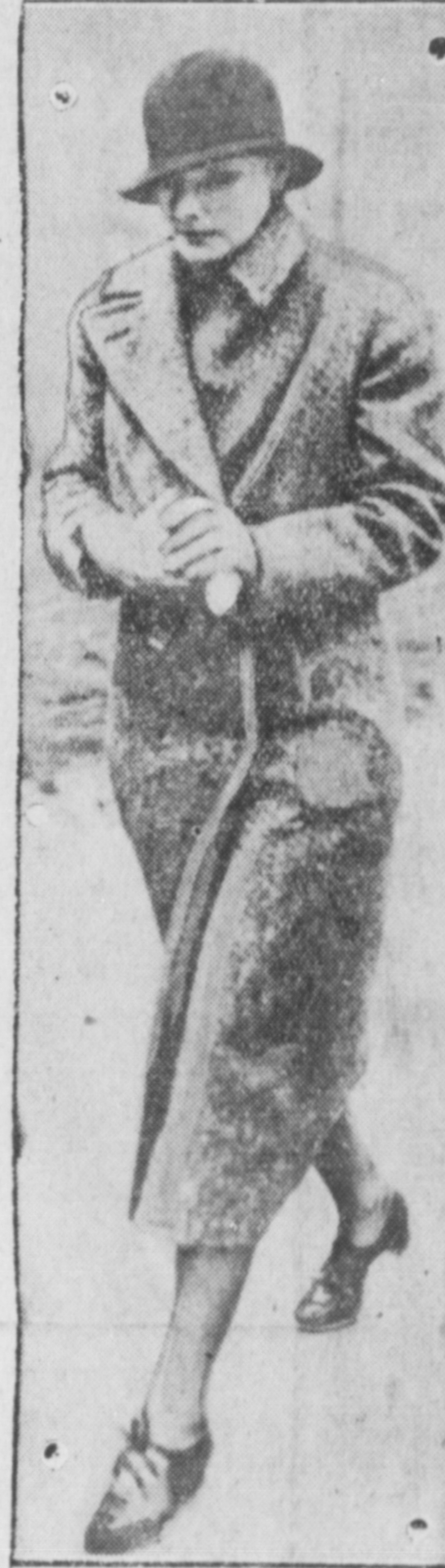
Star of "As You Desire Me" at Capitol Theatre this mid-week.

who disappears during the war when the country surrounding her home is cut off from the rest of Italy by the enemy advance. Years later one of her husband's friends, an artist who has painted her portrait, believes he has found her in Berlin living as the notorious mistress of an even more notorious debauchee. Her life and character are entirely dissimilar to that of the missing woman yet, when she returns to the Italian family, she fits into the old character and mode of living as if the dissolute Berlin interlude had never occurred. Then comes another woman who claims to be the missing wife with proofs of her identity which appear to be authentic. The picture leaves it to the audience to decide which is the right woman.