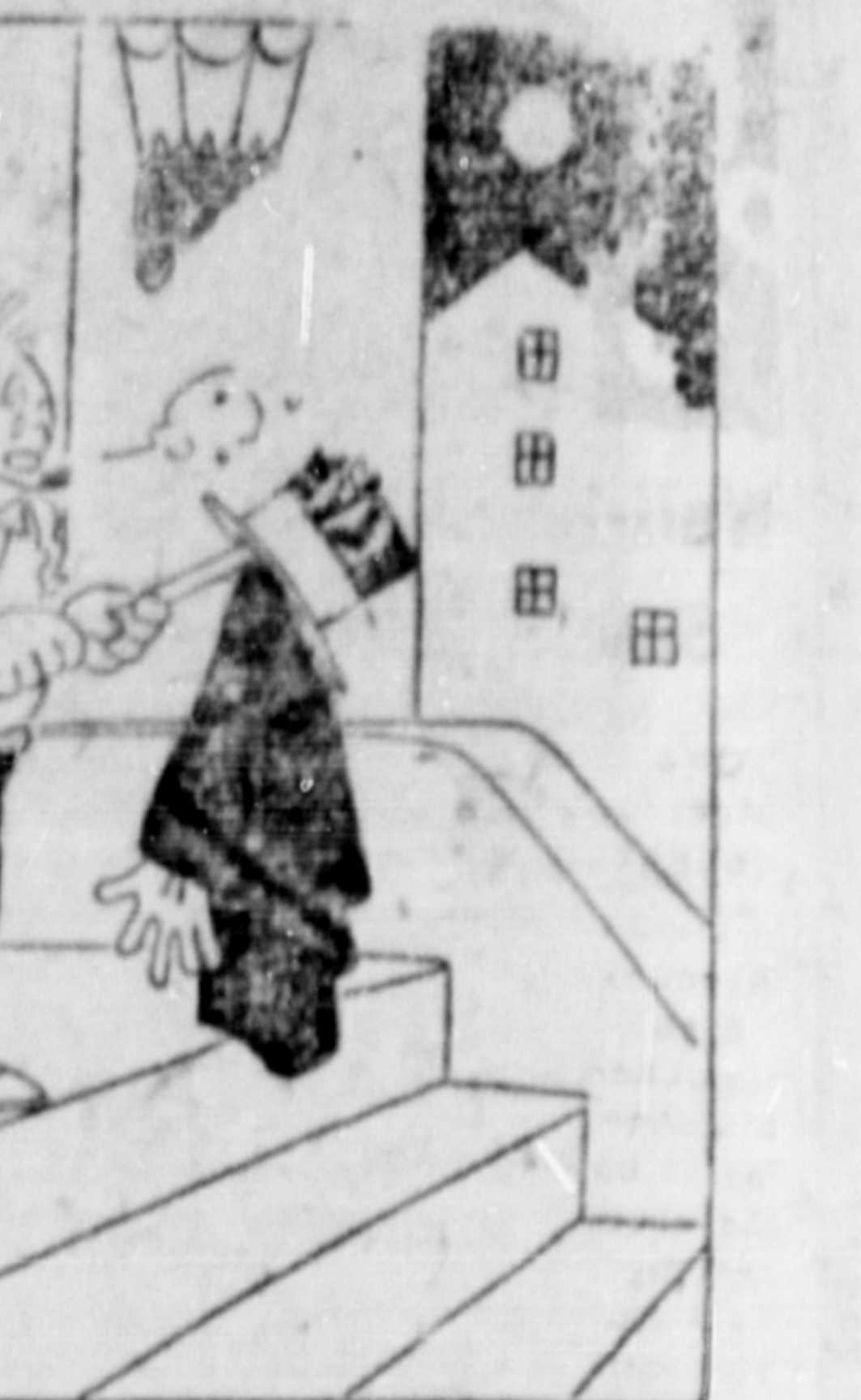
© 1922 BY INT'L FEATURE SERVICE, INC. 7-9