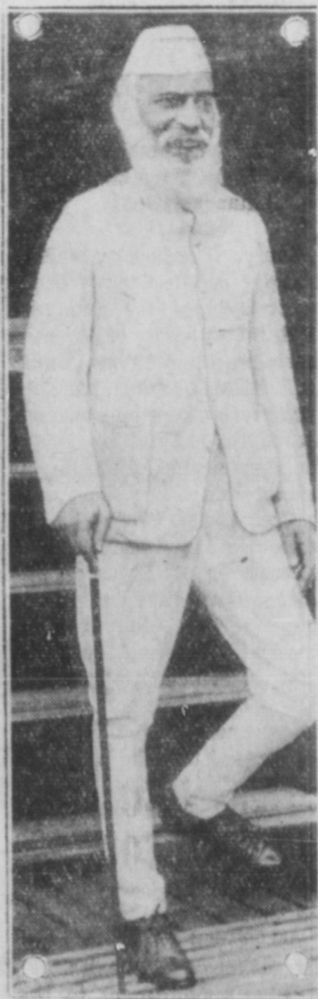
No pal of John Bull is Vithalbal Patel, ex-mayor of Bombay, India, who is touring United States getting a load off his chest. Here we see him arriving at New York.