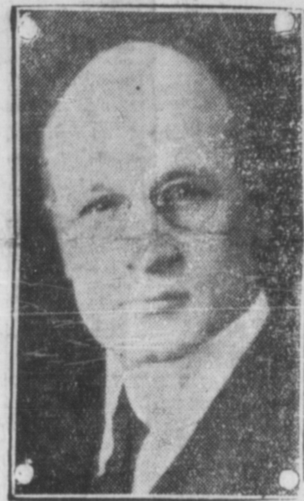
Hon. H. H. Stevens, who says Canadian government is concerned over exchange on British pound.