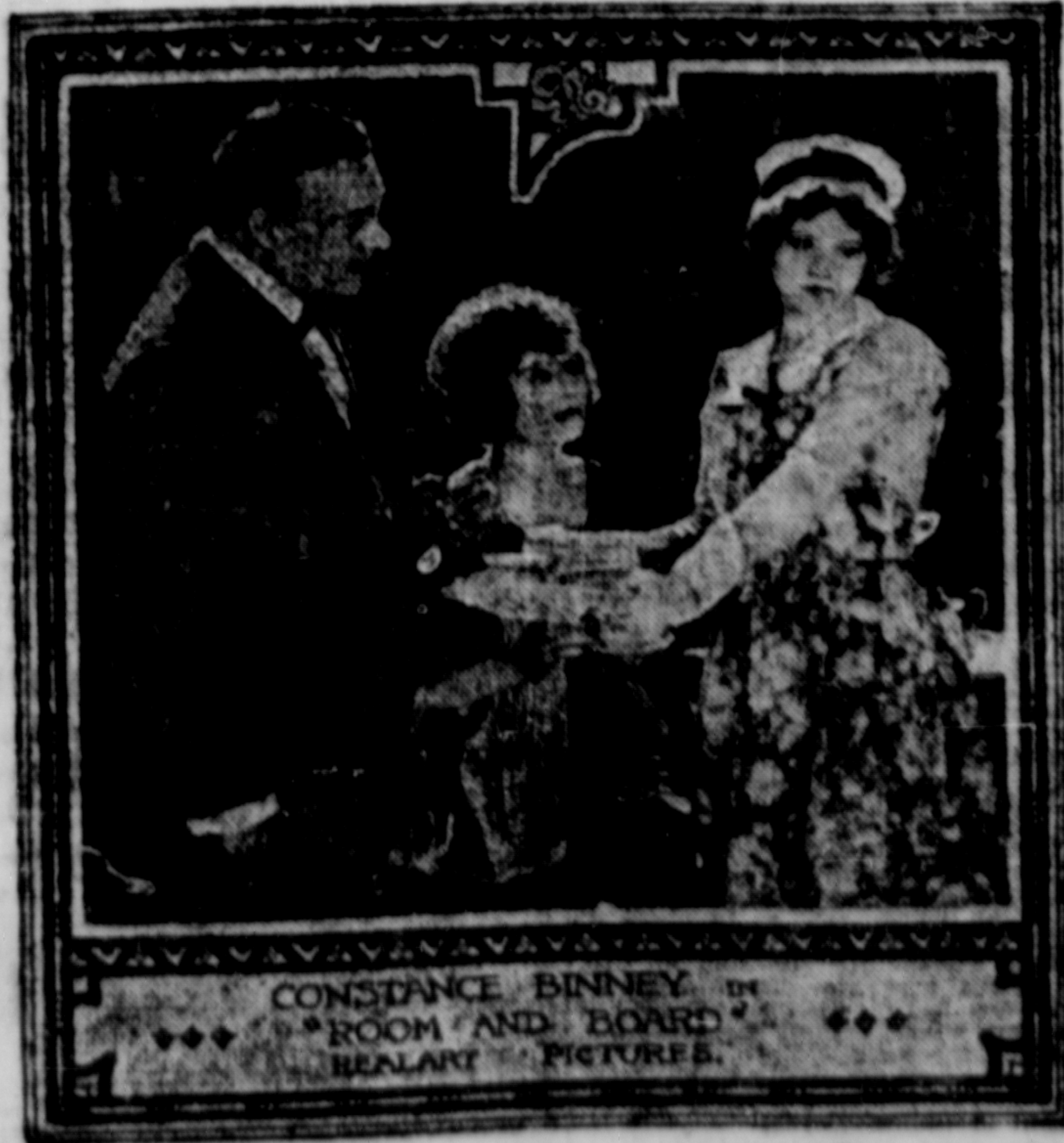
At the Westholme Tonight and Tomorrow.

CRUISING HUNTING PLEASURE Phone Black 400