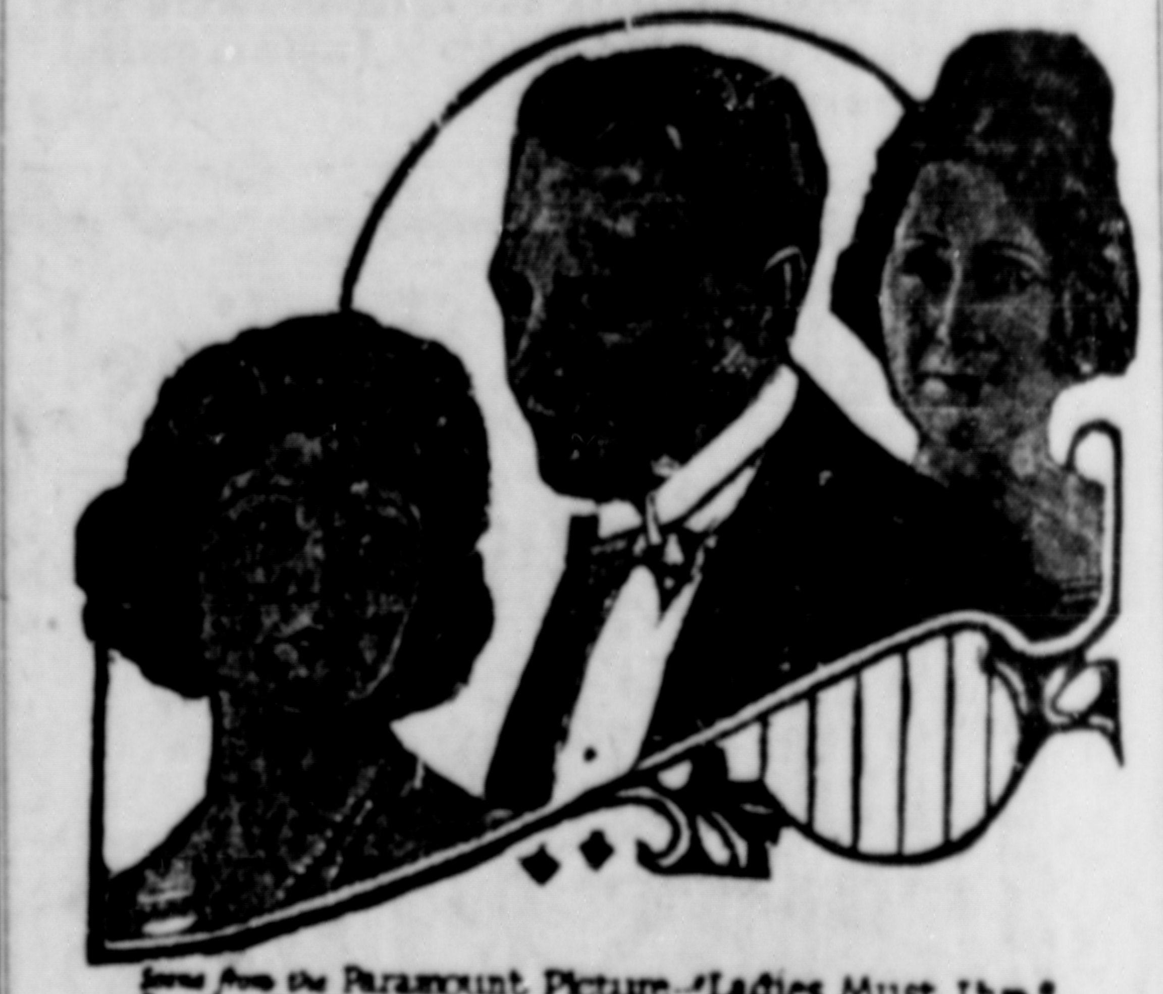
Scene from the Paramount Picture 'Ladies Must Live' featuring Betty Compson--A George Loane Tucker Production