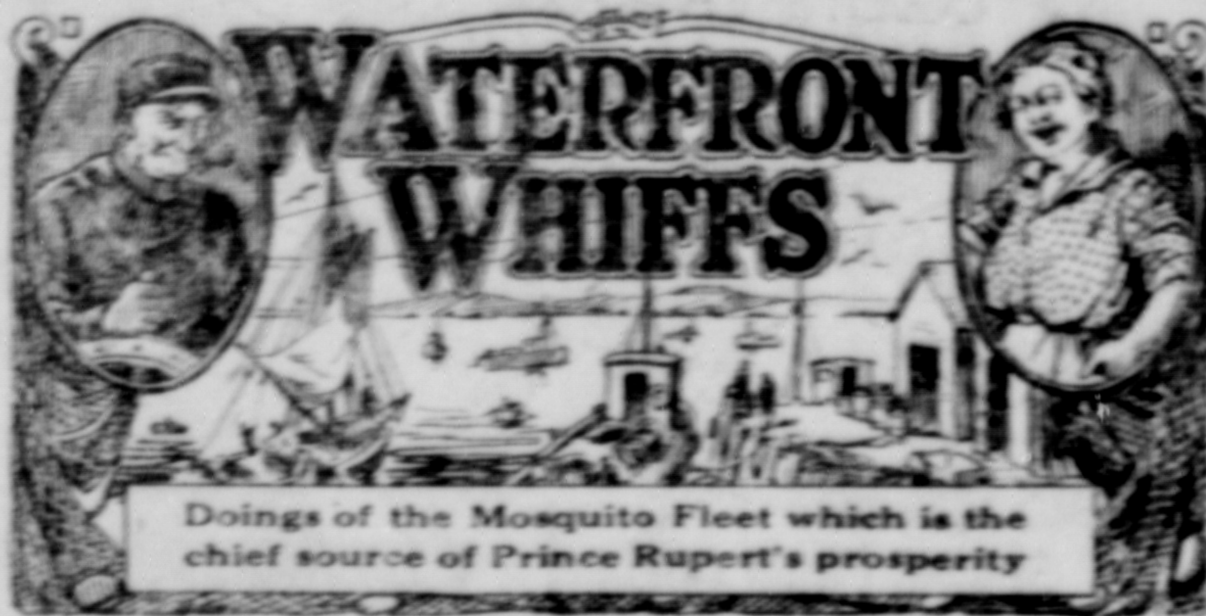
Doings of the Mosquito Fleet which is the chief source of Prince Rupert's prosperity