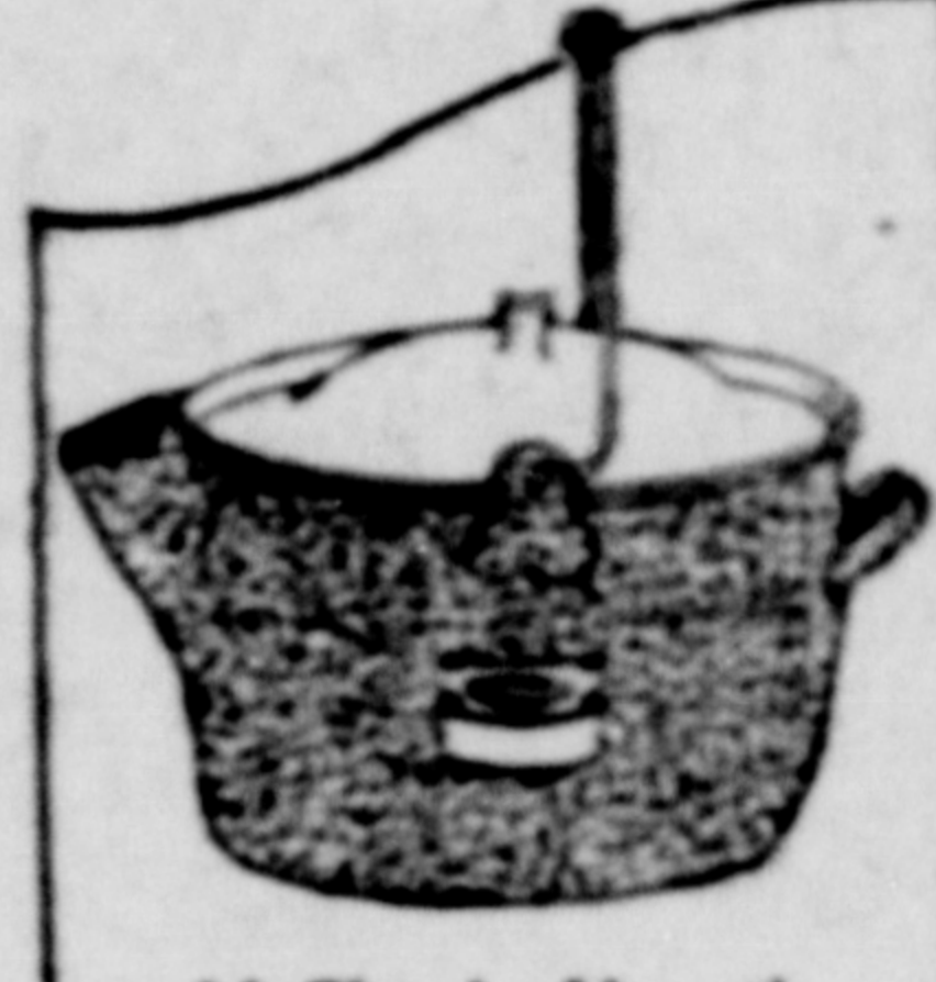
McClary's Utensils Preparing meals is less work when you have bright, clean utensils to work with. You can get McClary's 12 1/2" size and double Enamelled Cooking Utensils at your favorite hardware store. "The Clean Ware"

The operation of your range should make it easy to do your cooking and baking. The Kootenay eases the kitchen burden for all who use it.