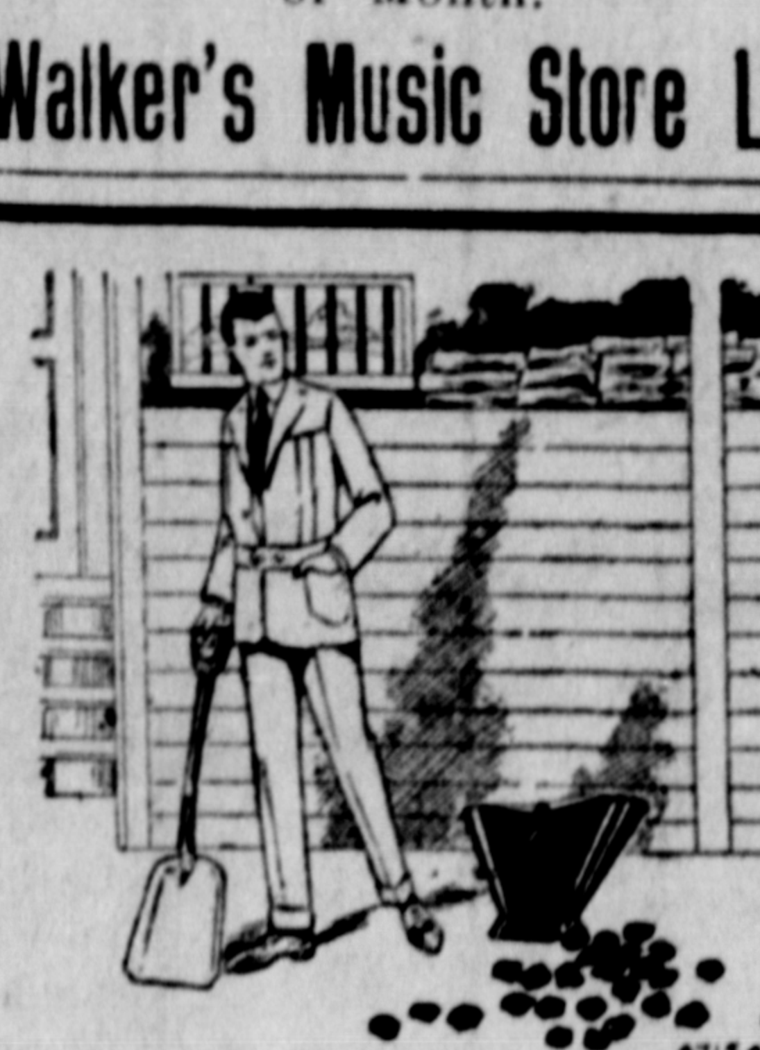
You can't get that flash heat so necessary to baking cakes unless you use clean Coal.

CONSUMERS COAL, cleaned free from choking shale, burns brightly. It sends clean heat direct to the oven—steady heat which stays. Our Coal is free from soot.