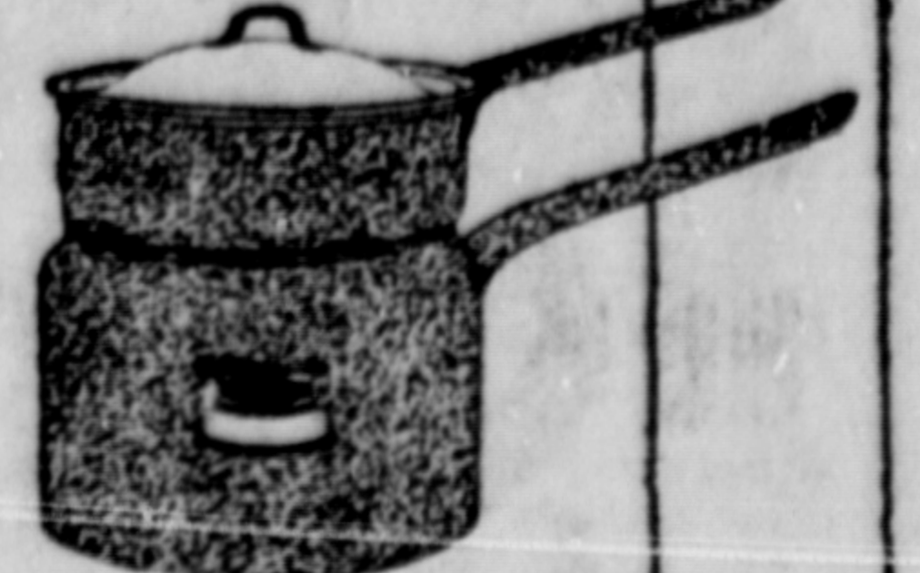
McClary's Cooking Utensils Tough, glassy smooth, kitchen ware, made to keep that clean, new appearance—McClary's enameled cooking utensils are sold by your favorite hardware store. "The Clean Ware"