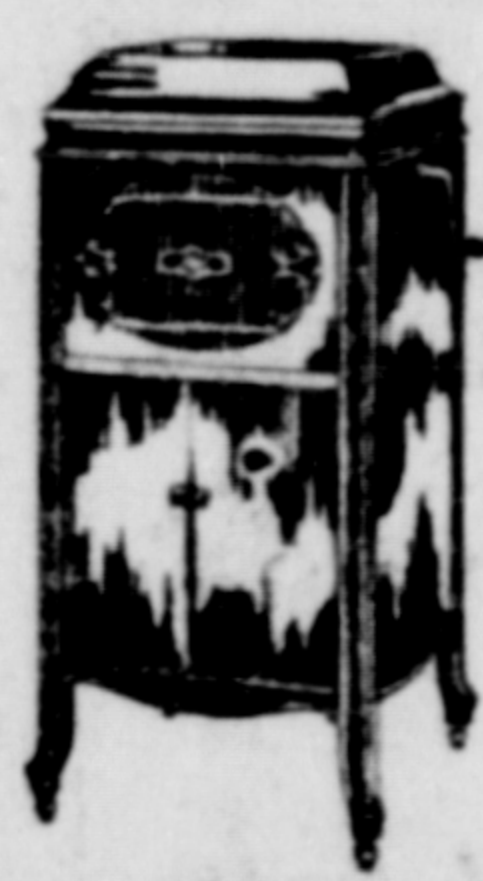
Always in Illustrated Style $12—$200. Other Table, Cabinet and Console Models from $60 to $400.

Come in and let us show you how well the Brunswick fulfills every claim we make for it.