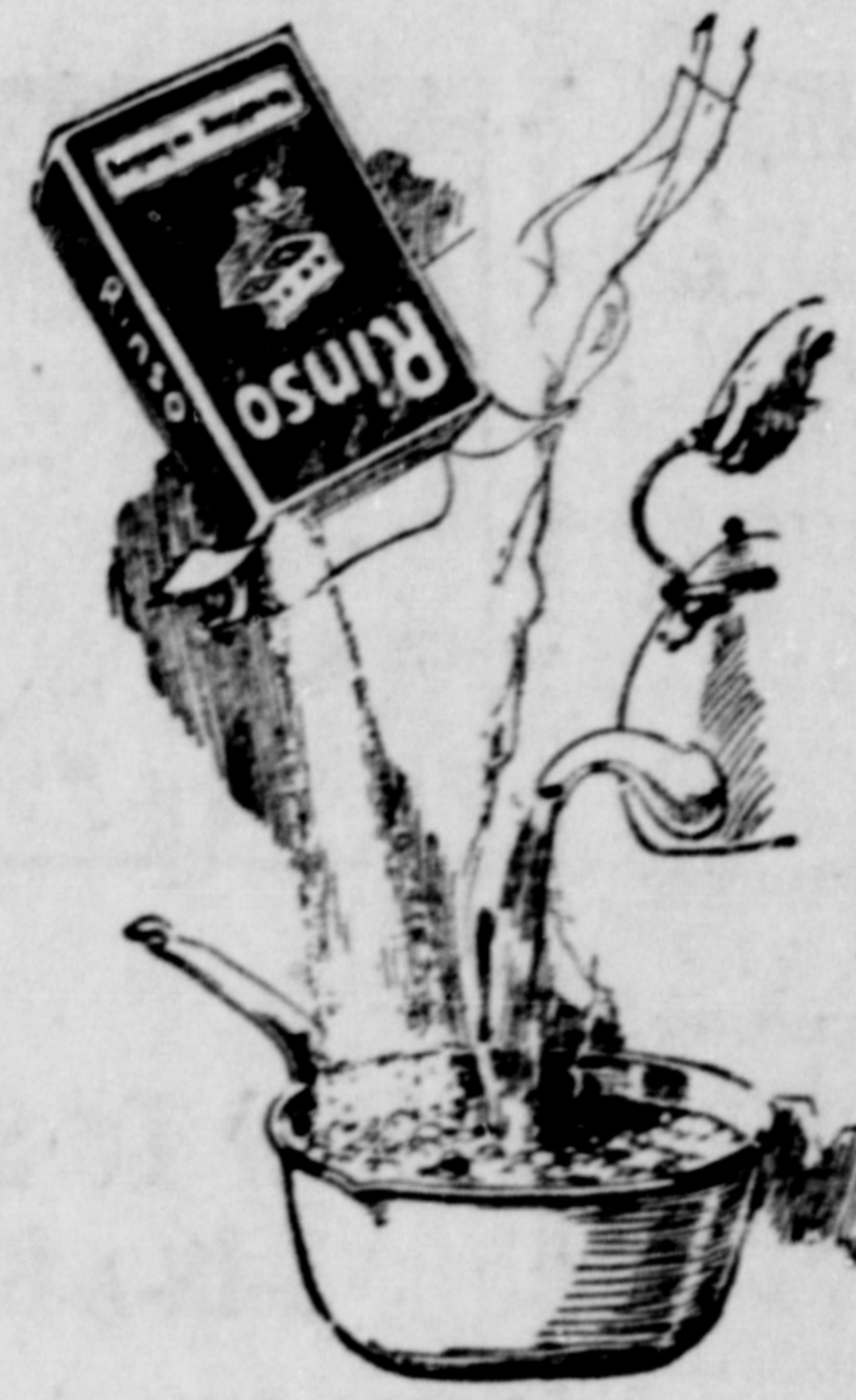
Dissolve in boiling water Pour into tub of lukewarm water Use enough to get big lasting suds

For all the regular family wash Rinso soaks clothes so clean that boiling isn't necessary. But if you like to boil your white cottons, pour enough Rinso solution into your boiler to give you the suds you like.