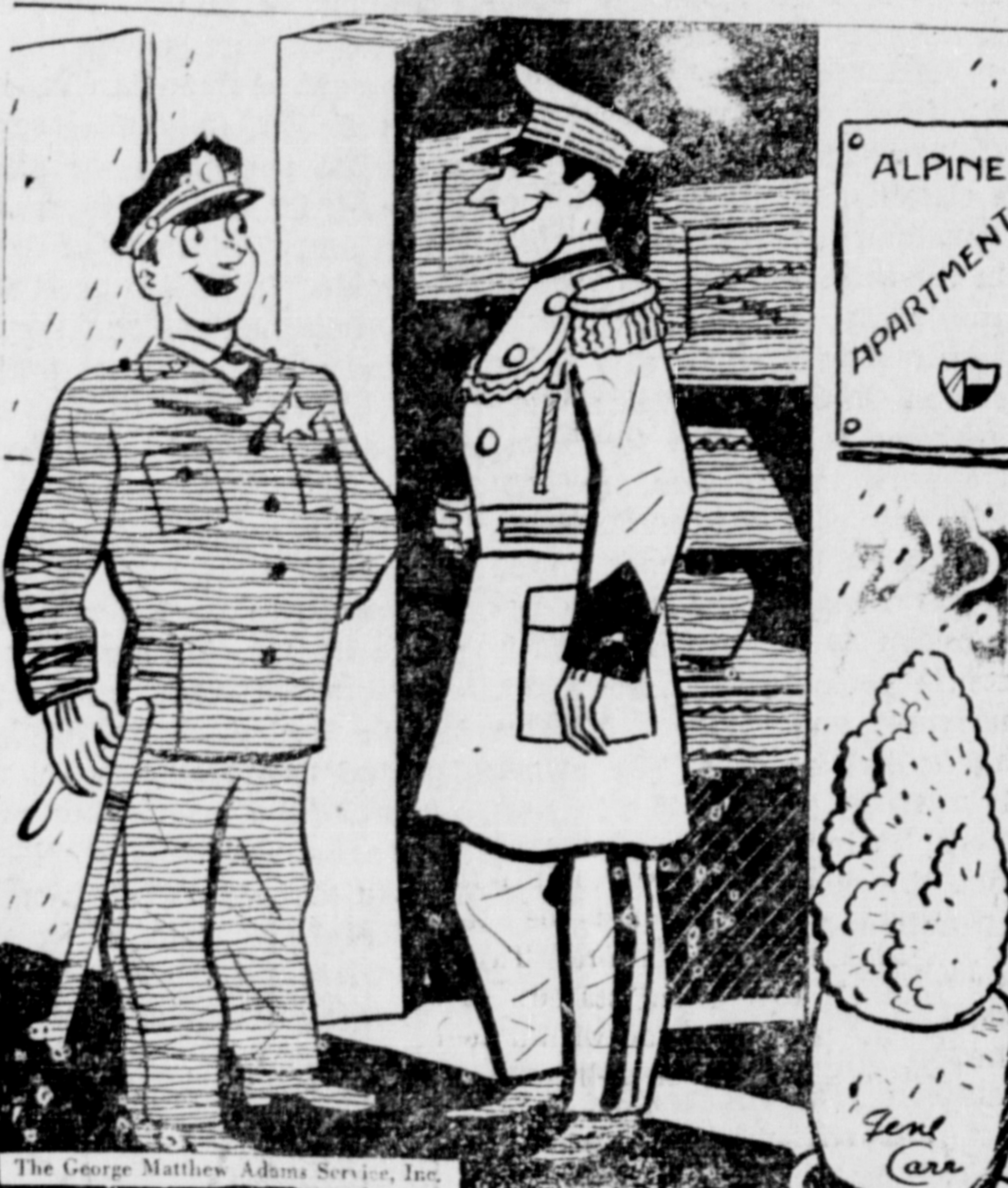
"Well, here we are, Murphy—out of uniform and back in civilian life again."