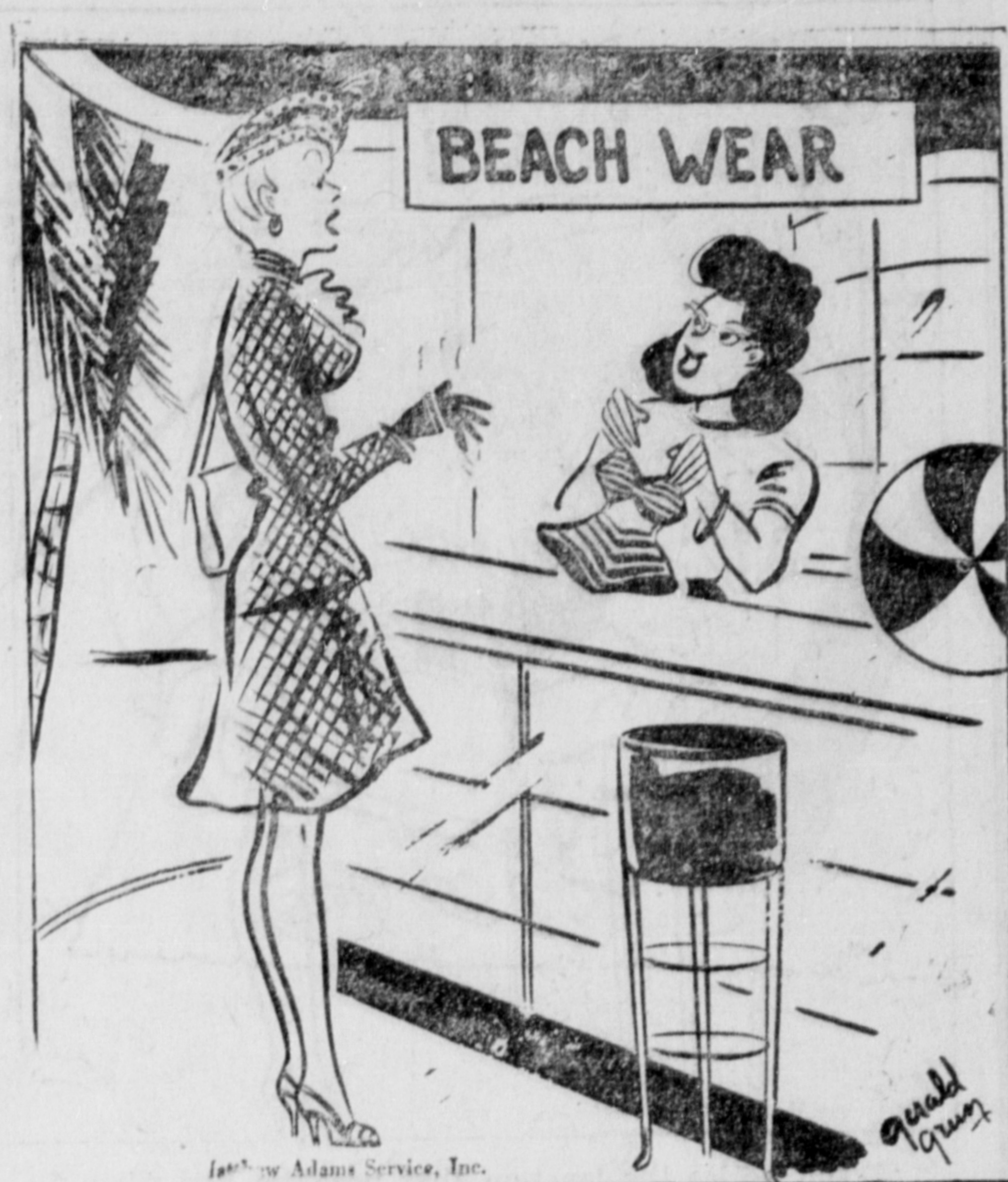
"This one will make you look shorter, and men look longer."

CAMPERS Supplies delivered twice weekly to Lake Kathryn. GOODACRES' SMITHERS, B.C. (202)