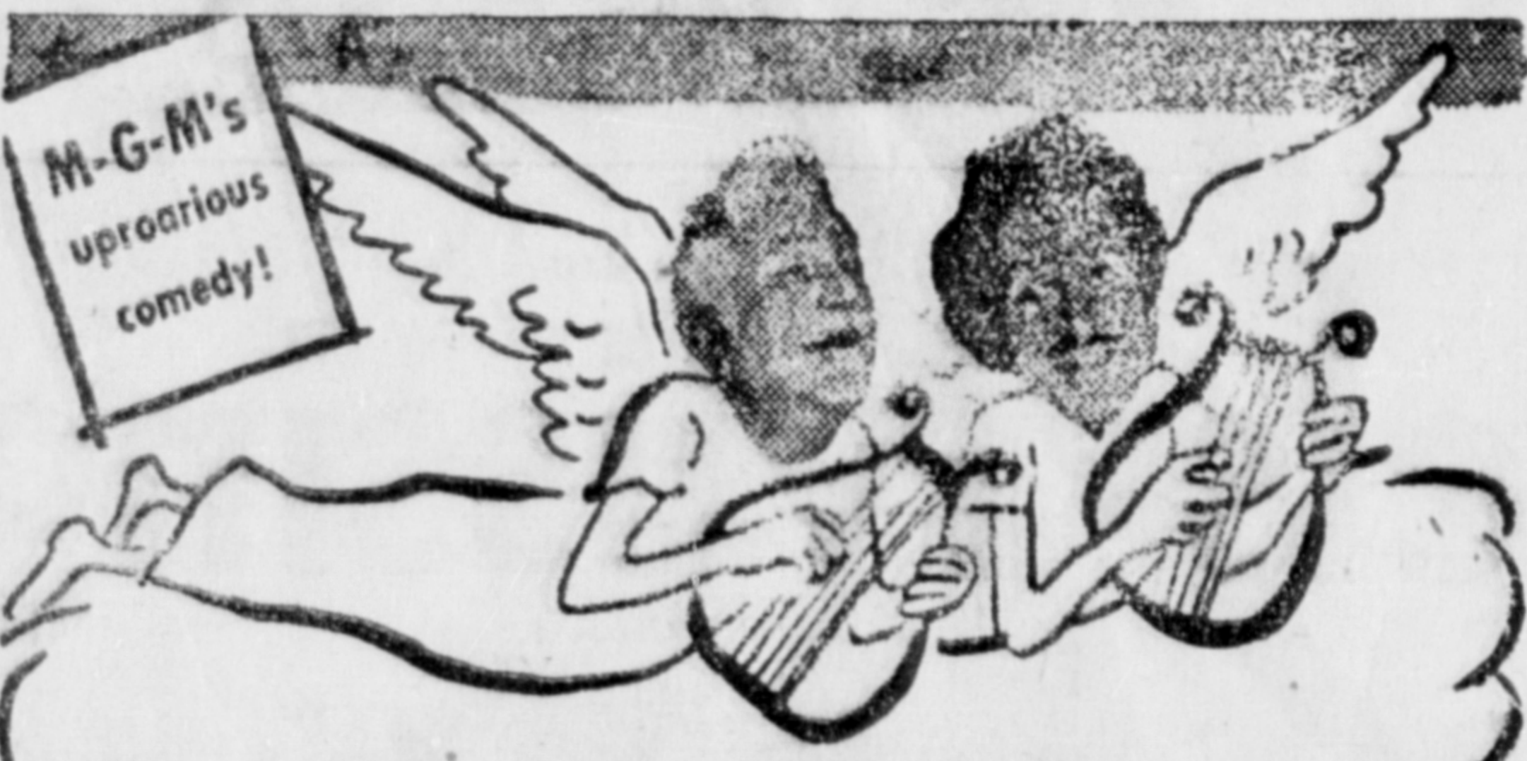
The Funniest Miracle That Ever Hit This Cockeyed World!