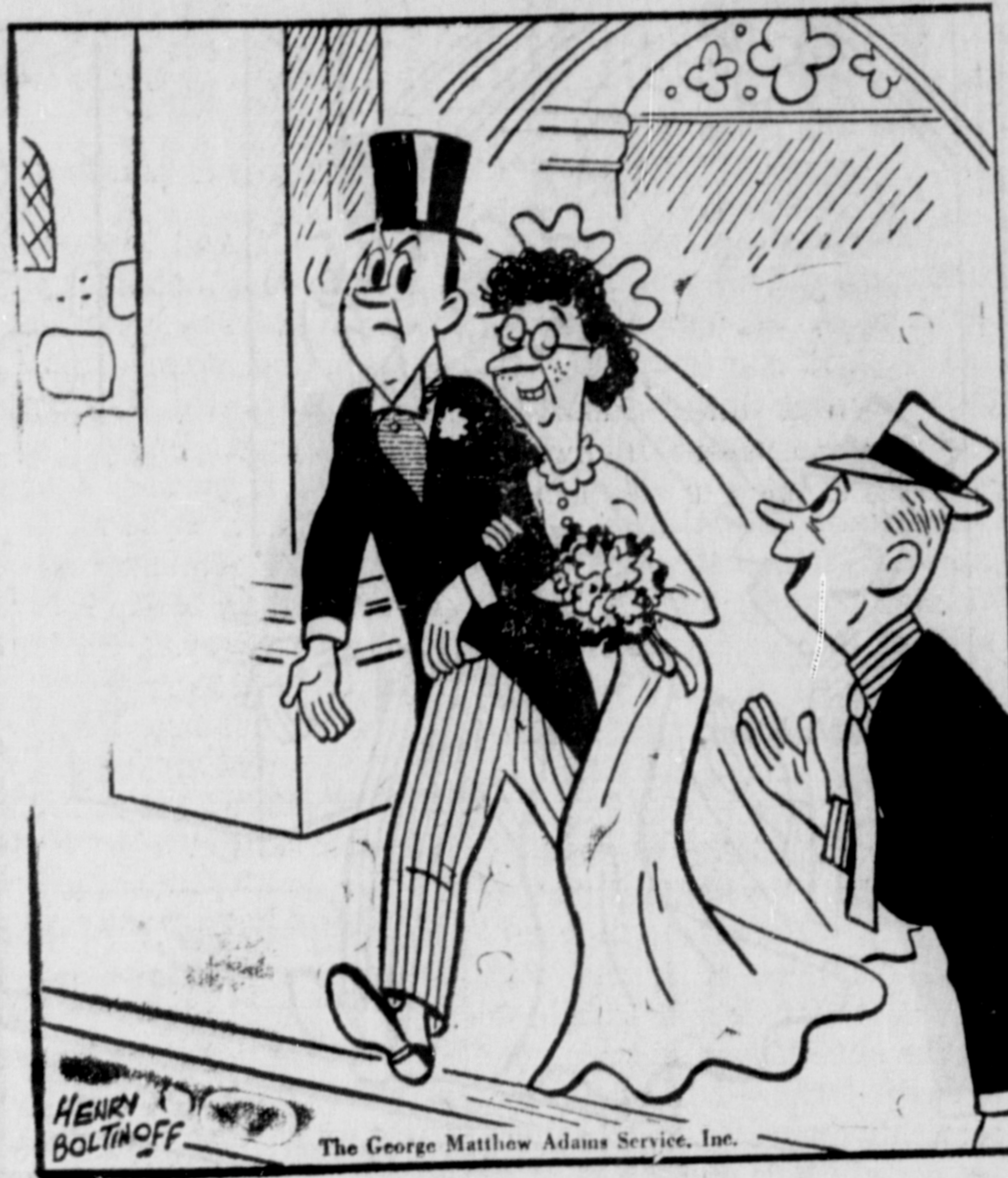
"Lose a bet, Buddy?"