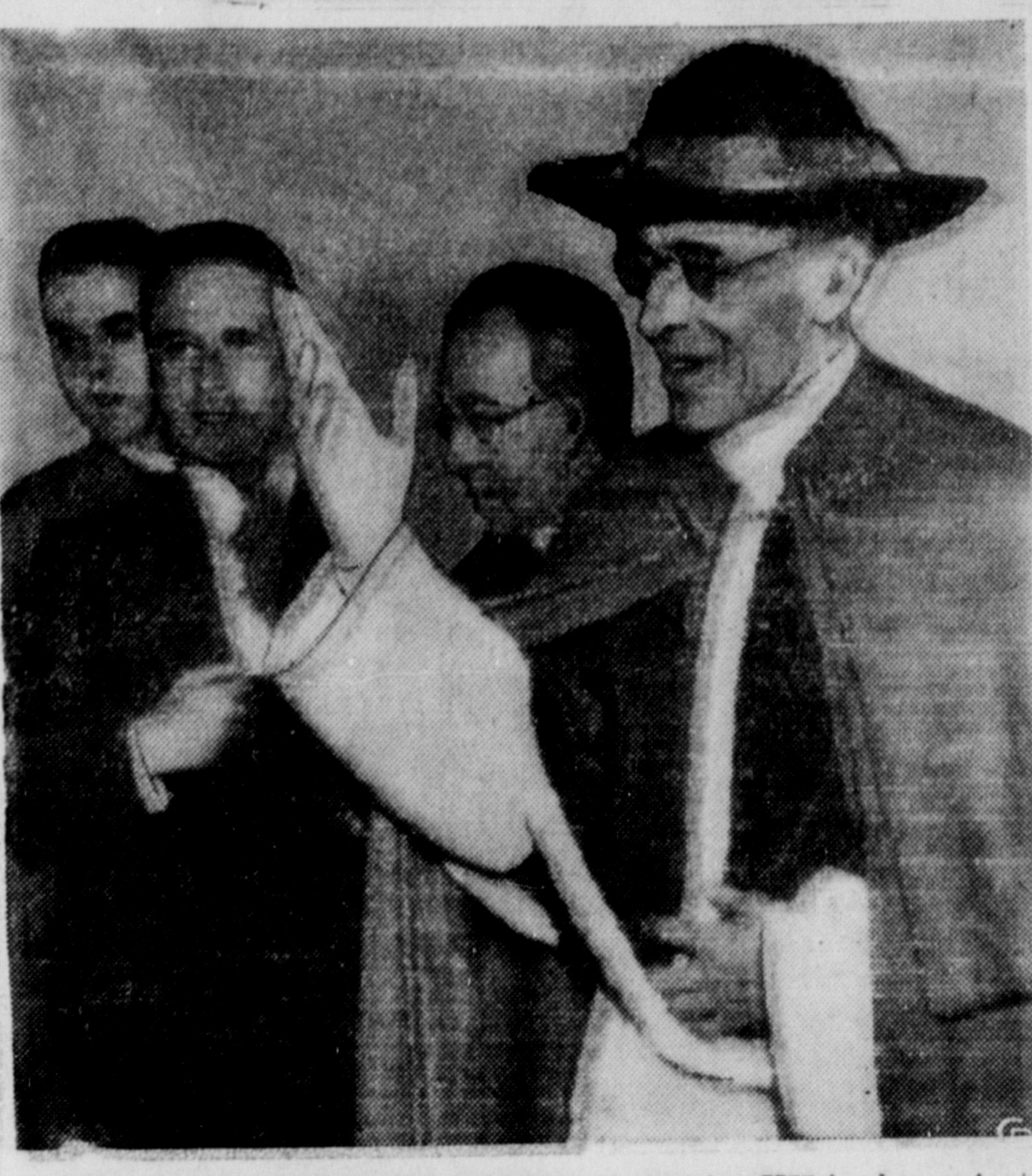
AFTER POPE ADDRESSED RALLY—Pope Pius XII is shown just after he spoke before 50,000 delegates of the Italian convention of Men of Catholic Action in St. Peter's Square, Vatican City, Rome. The pontiff declared: "Time for reflection and planning is past. Now is the time for taking action."