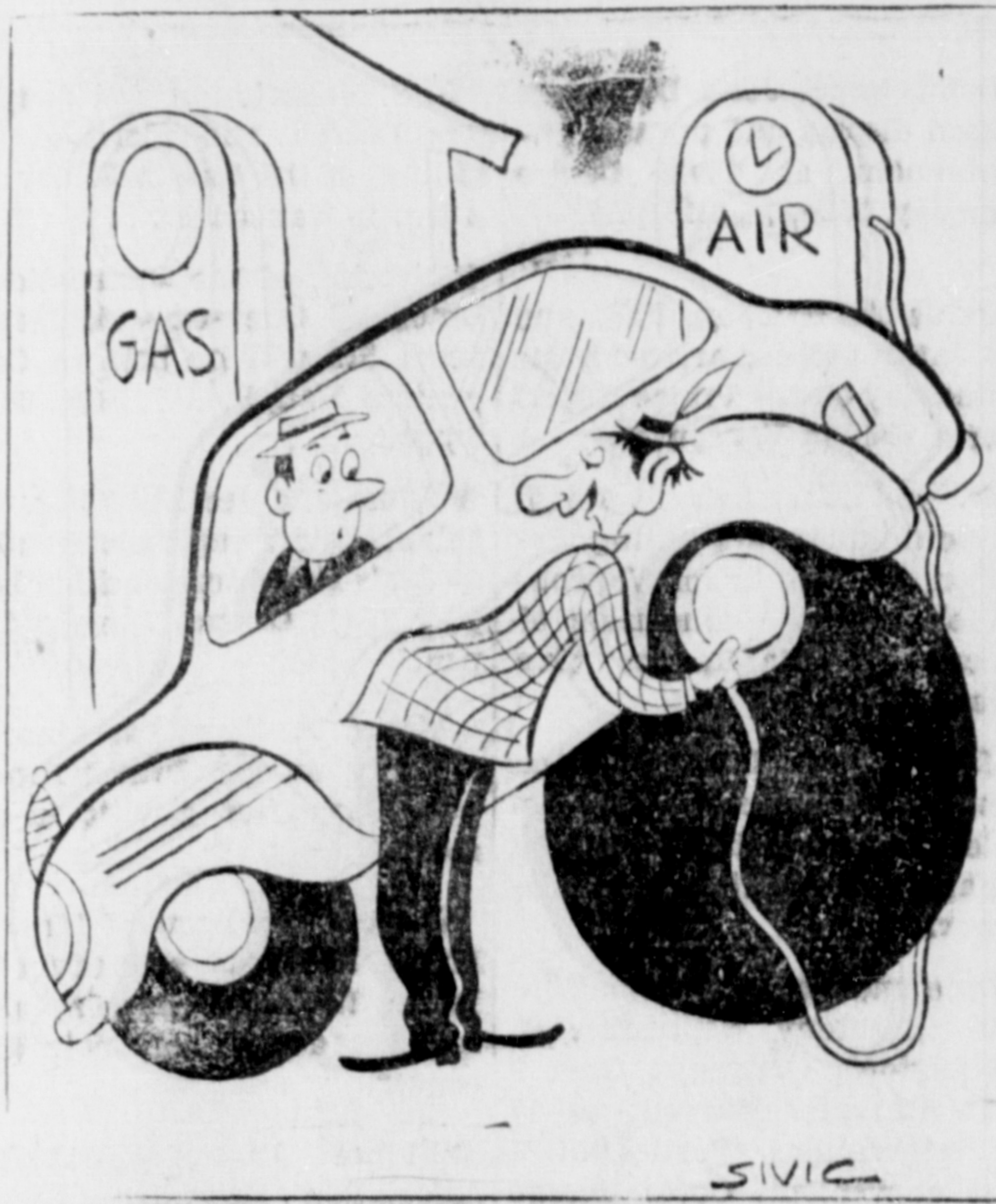
"Naw—I don't work here. Wh?"

the robbery was easy on account of the combination lock on the safe not having been locked. Mr. Frizzell discovered the robbery late in the evening.