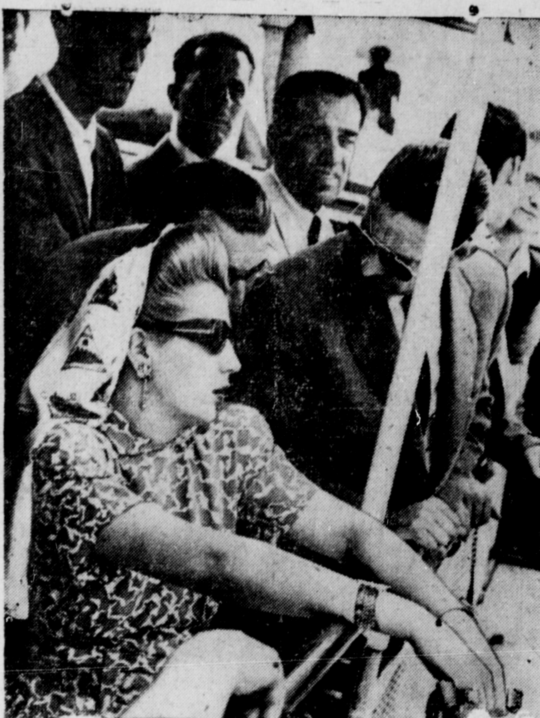
ARGENTINA'S LADY VISITS LAKE COMO—Dona Eva Duarte Peron, wife of the president of Argentina, is shown on a sight-seeing tour of Lake Como, one of Italy's beauty spots. One of the spots of recent historic interest pointed out to the distinguished tourist was the place where Benito Mussolini reached the end of his path of glory before a firing squad of his own countrymen.

HICKS FRASER HOUSE Modern, Quiet, Comfortable 714 FRASER STREET Phone Black 823