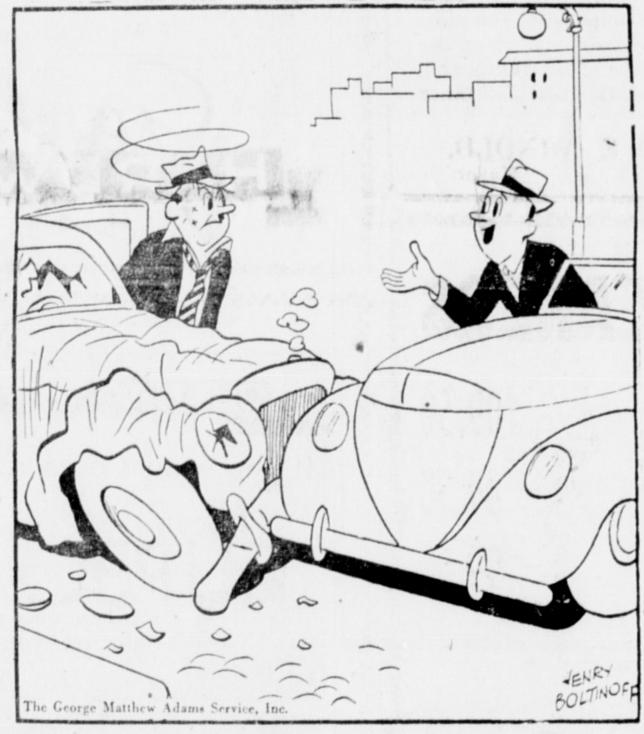
"Well, if it isn't Mr. Plunket! How about that salary raise you promised me?"