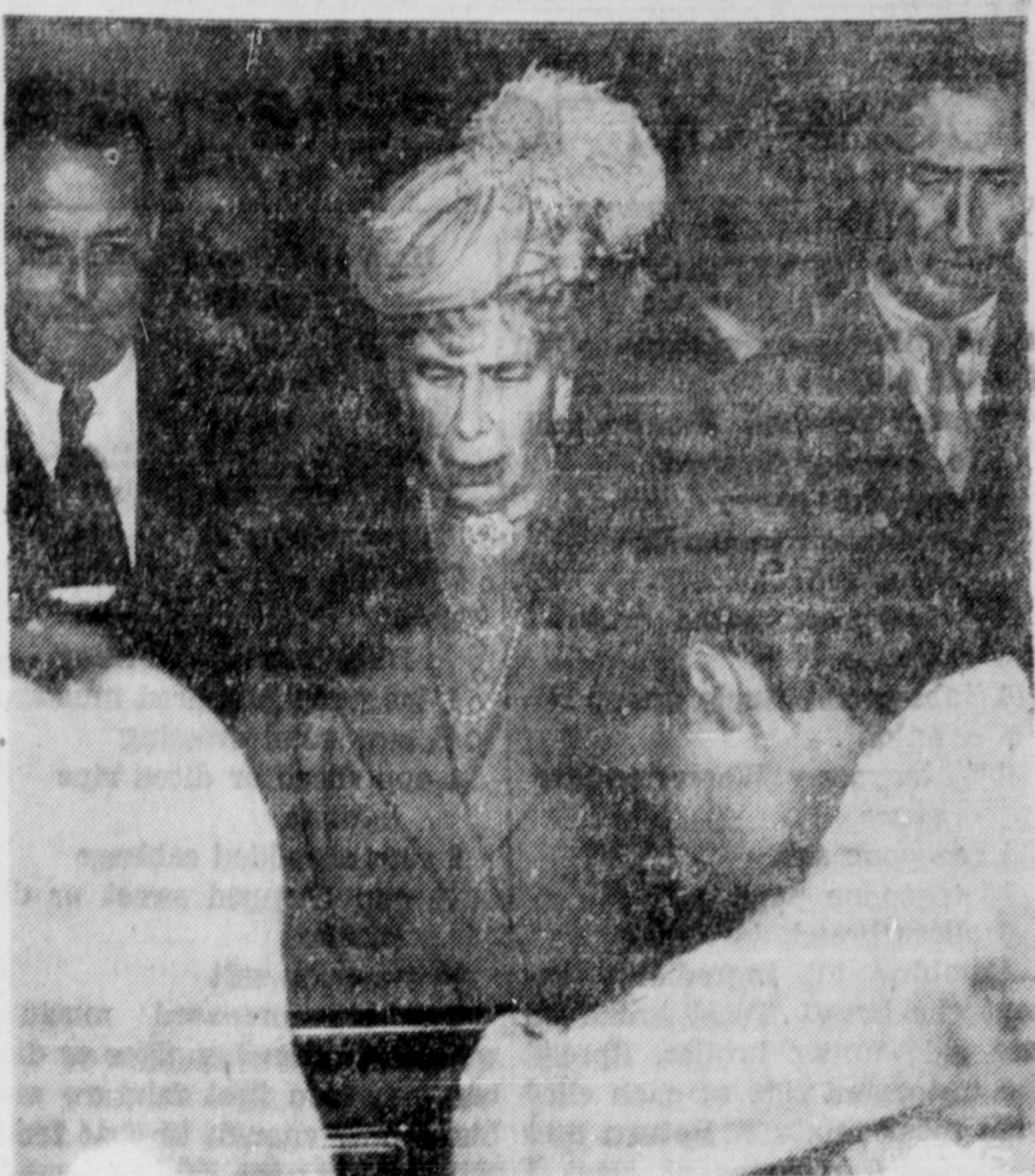
QUEEN MARY VISITS RADIO EXHIBITION—Her majesty Queen Mary is shown taking an interest in a demonstration on one of the stands at Britain's post-war radio exhibition which opened recently at Olympia. She saw the latest developments in British radio both for the home buyer and the all-important export trade.