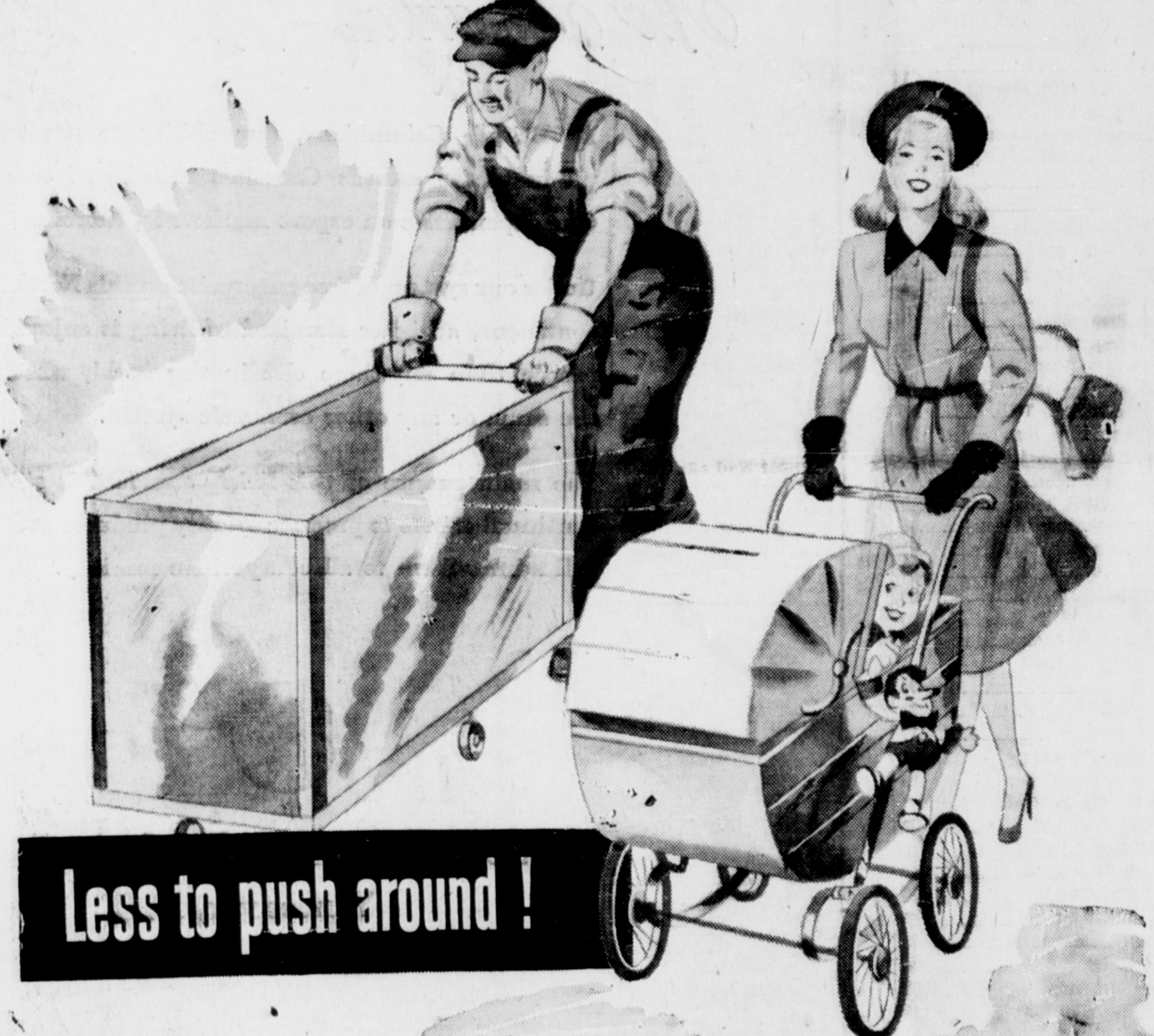
Less to push around!

A dignitary in the Lord Chamberlain's office choked at the very thought of fog on w-Day, remarking with a shudder: "It's too horrible to contemplate."