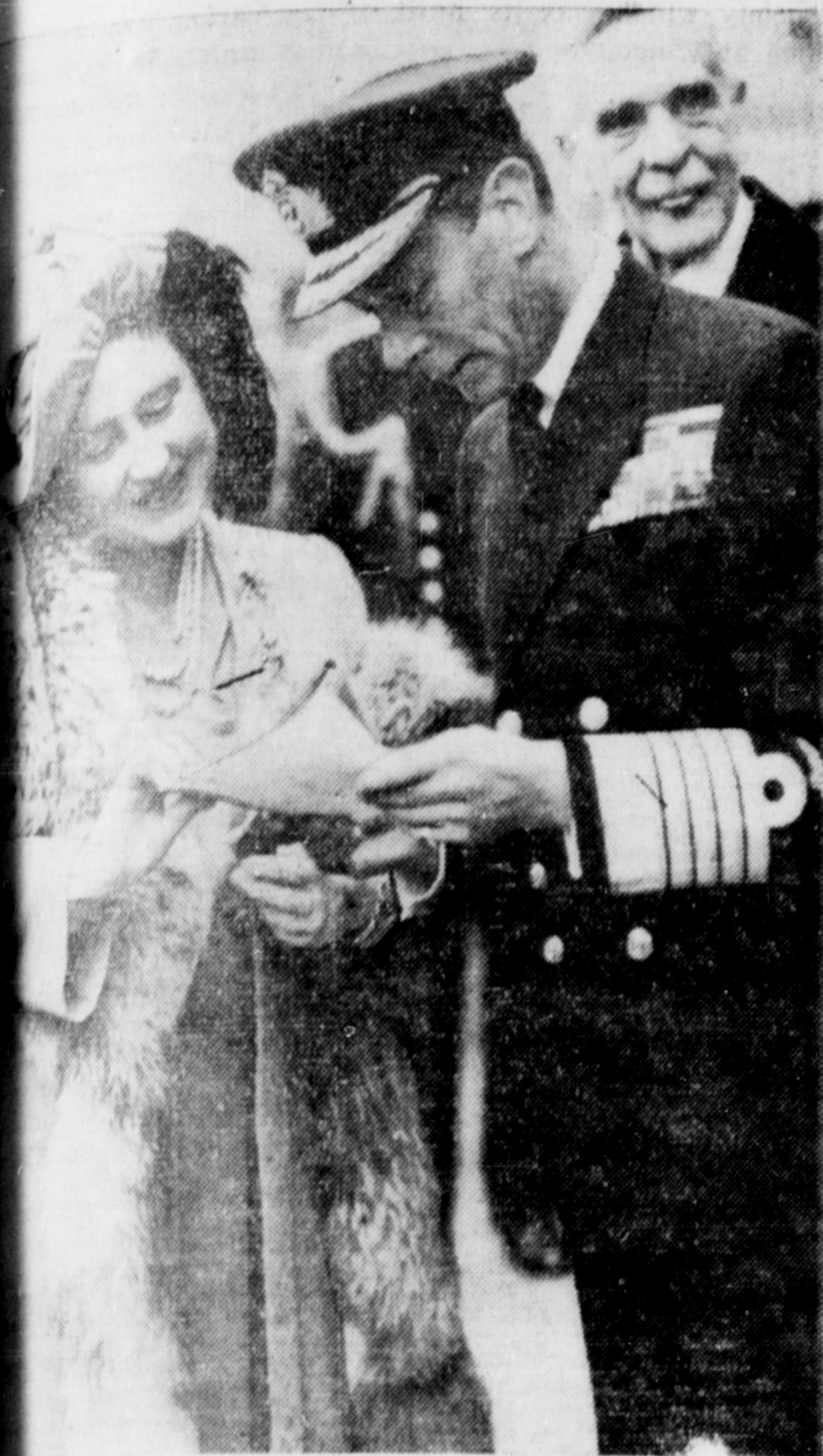
George and Queen Elizabeth, parents of Princess Elizabeth, are shown looking at an old map of Plymouth, Eng., on a two-day tour of the city.