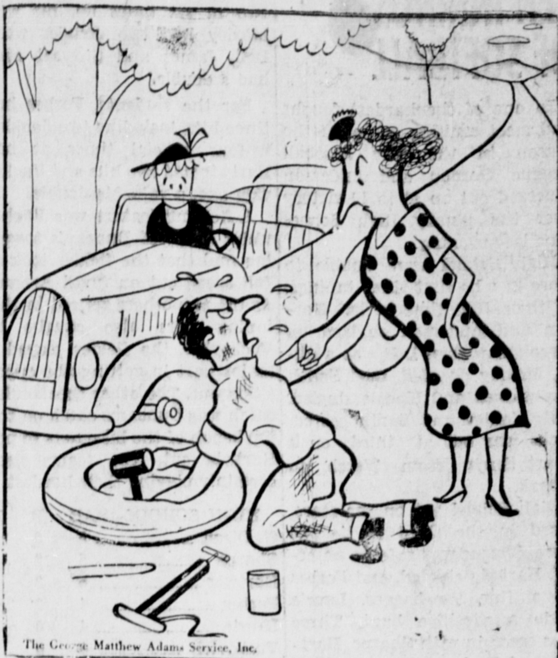
"Do I tell you how to tell me how to drive?"