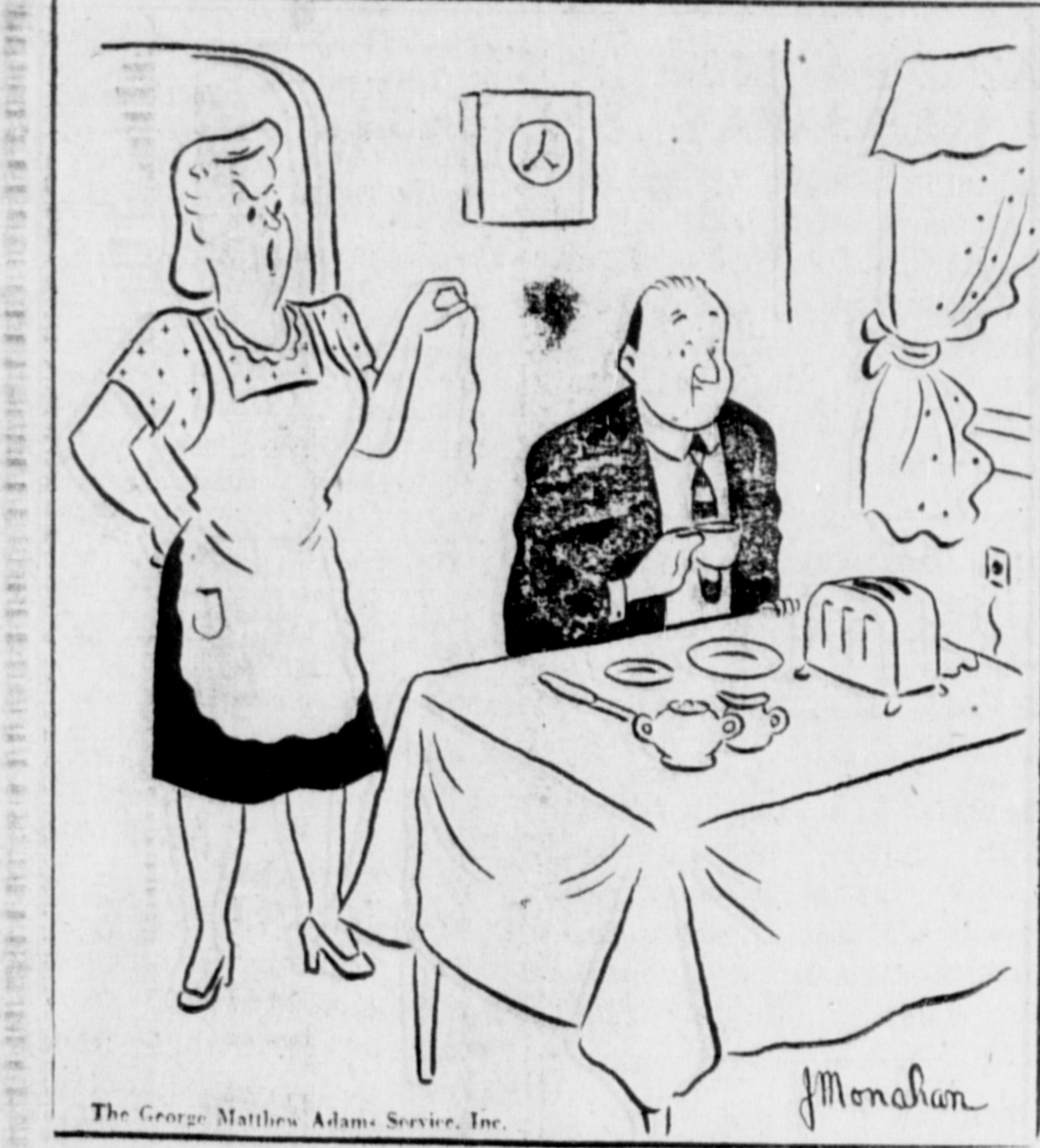
"That sick friend you sat up with last night—he needs a haircut!"