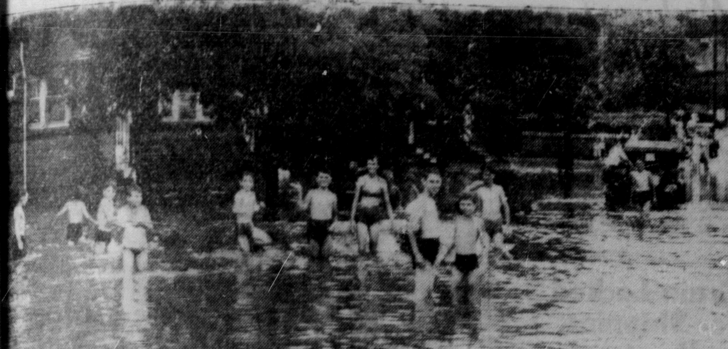
STREET SWIMMERS —Following an unusually heavy rain youngsters in Toronto's suburban York township were able to go for a swim on Harvie Ave. Basements in houses were flooded and automobiles stalled after the heaviest downpour—1.33 inches—of the year in Toronto.